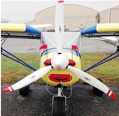
Zenith 701 Engine Inlet Plugs

have warning flags that are visible from the cockpit or 'remove before flight' streamers sewn onto the face of the plugs. Most plugs are imprinted with the aircraft registration number in black for an extra charge. Storage bag NOT included. Engine plugs may be inserted after flight when the engine is still warm. Engine Inlet Plugs are commonly referred to as Cowl Plugs, Intake Plugs, Cowl Blocks, Engine Blocks, and Engine Bungs.