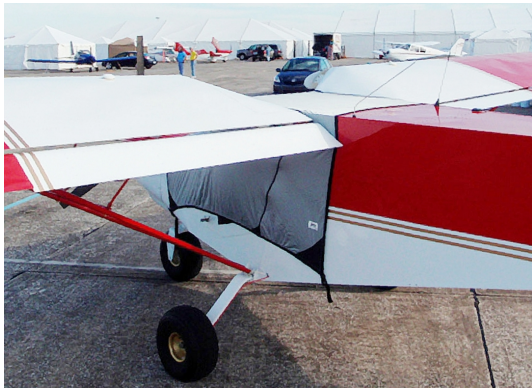
Zenith 701 Spandex FlyAway Travel Canopy Cover