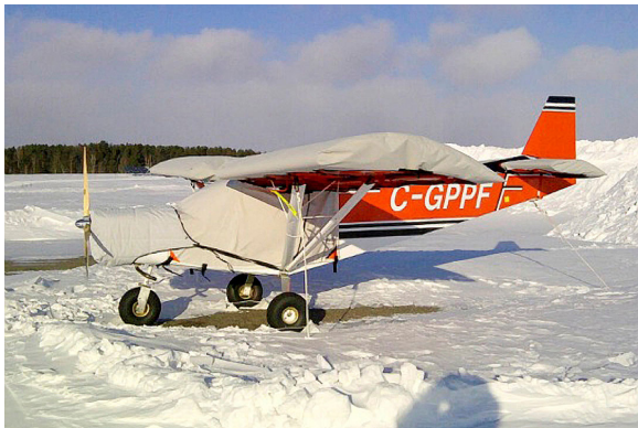
Zenith 701 Canopy, Wing, Tail & Insulated Engine Covers