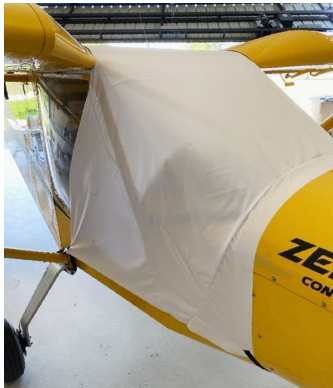
Zenith 750 Windshield Cover

This cover type is made from Silver Acrylic Sunbrella canvas and is 100% lined with a soft and smooth microfiber. Bruce's Custom Covers developed this material combination especially for aircraft protection. The outer material is medium weight and treated for water resistance, UV resistance and anti-static buildup. The inner lining is a very soft and smooth microfiber to prevent scratching. The material is very reflective, and tests show that the cabin interior temperature can be reduced to near-ambient temperature on the hottest of days. It is water, ice and snow repellent, yet breathable to allow moisture to escape from between the cover and the aircraft surface.