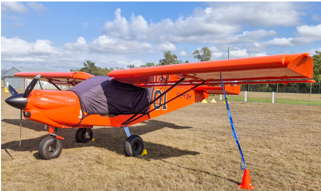
CH750 STOL Travel Cover, Light Weight Extended Canopy Cover