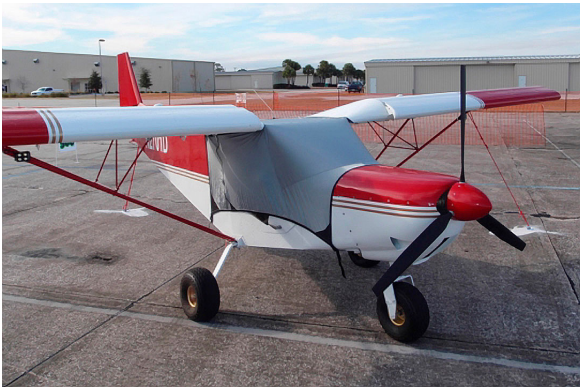
Zenith 701 Spandex FlyAway Travel Canopy Cover

This cover type is made from Silver Acrylic Sunbrella canvas and is 100% lined with a soft and smooth microfiber. Bruce's Custom Covers developed this material combination especially for aircraft protection. The outer material is medium weight and treated for water resistance, UV resistance and anti-static buildup. The inner lining is a very soft and smooth microfiber to prevent scratching. The material is very reflective, and tests show that the cabin interior temperature can be reduced to near-ambient temperature on the hottest of days. It is water, ice and snow repellent, yet breathable to allow moisture to escape from between the cover and the aircraft surface.