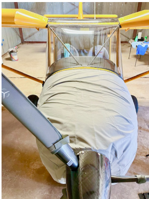
Zenith CH 750 Cruiser Engine Cover, Open Bottom

The material is very reflective, and tests show that the cabin interior temperature can be reduced to near-ambient temperature on the hottest of days. It is water, ice and snow repellent, yet breathable to allow moisture to escape from between the cover and the aircraft surface.