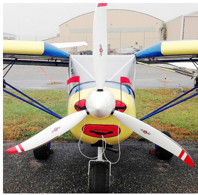
Zenith 701 Engine Inlet Plugs