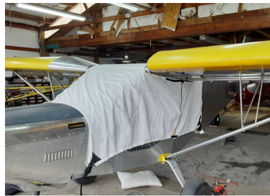
Zenair 750 Over The Top Style Canopy Cover