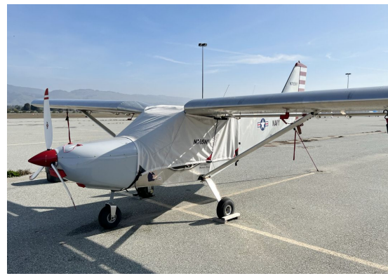
Zenair 750 & Cruiser Extended Canopy Cover