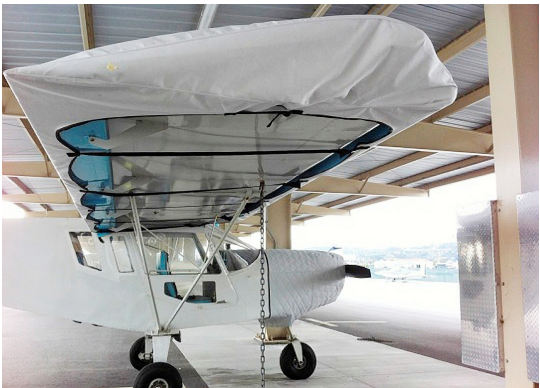
Zenith 801 Wing & Insulated Engine Covers

WINTER USE MATERIAL - Made with Solution-Dyed Polyester fabric, this option is intended for seasonal use to aid in deicing, rain mitigation, or for occasional travel. The material is lighter and more compact, but more susceptible to UV damage and may have a shorter useful life if used continuously outside than the all-year use material.