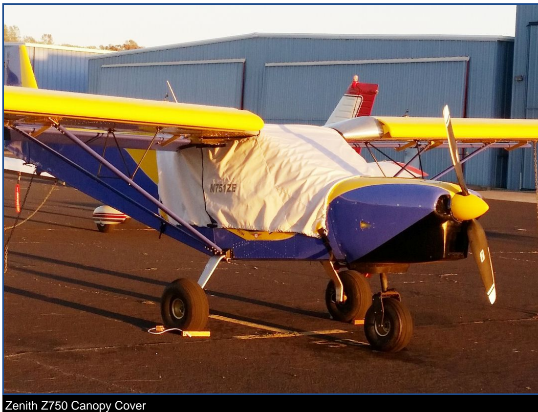
Zenith Z750 Canopy Cover