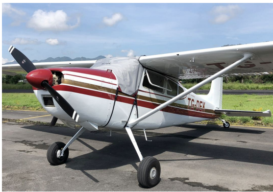
Cessna 180 Windshield Cover