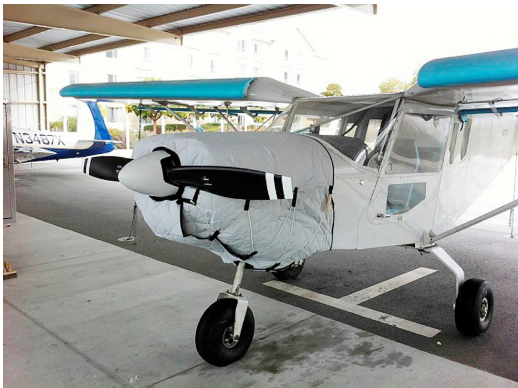
Zenith 801 Insulated Engine Cover