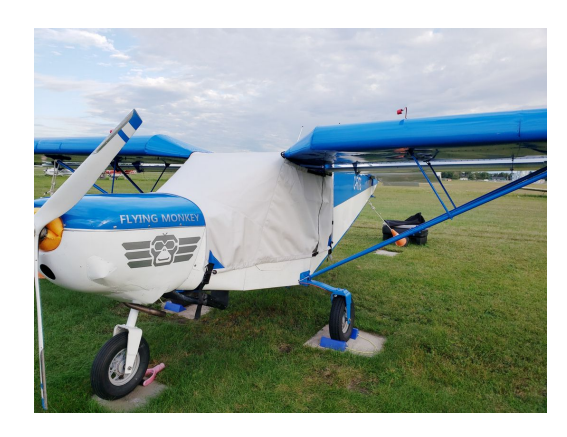
Zenith Zenair 701 Canopy Cover, Over-Top Style