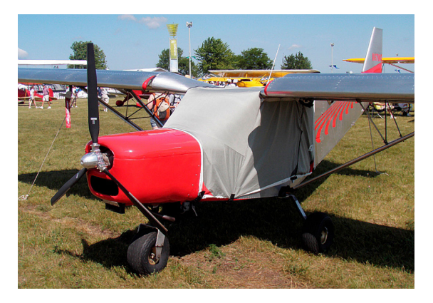
Zenith CH701 Standard Canopy Cover

This cover type is made from Silver Acrylic Sunbrella canvas and is 100% lined with a soft and smooth microfiber. Bruce's Custom Covers developed this material combination especially for aircraft protection. The outer material is medium weight and treated for water resistance, UV resistance and anti-static buildup. The inner lining is a very soft and smooth microfiber to prevent scratching. The material is very reflective, and tests show that the cabin interior temperature can be reduced to near-ambient temperature on the hottest of days. It is water, ice and snow repellent, yet breathable to allow moisture to escape from between the cover and the aircraft surface.