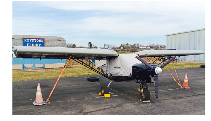
Zenith 701 Canopy Cover, Wing Covers, Padded For Hail Protection, All Year Use