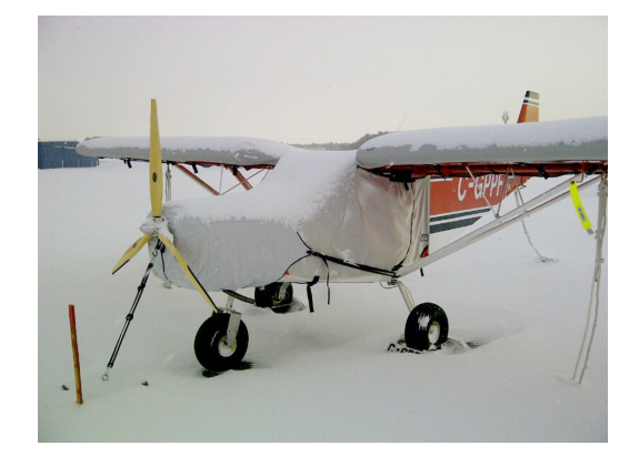
Zenith 701 Canopy, Wing, Tail & Insulated Engine Covers