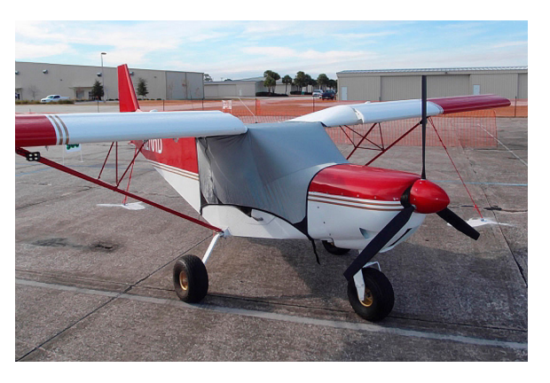
Zenith 701 Spandex FlyAway Travel Canopy Cover