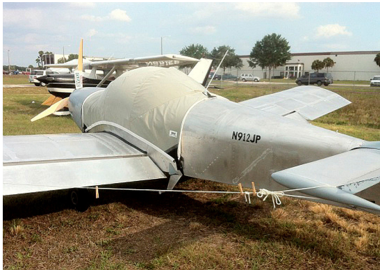
Zenith 601 XL Canopy Cover

This cover type is made from Silver Acrylic Sunbrella canvas and is 100% lined with a soft and smooth microfiber. Bruce's Custom Covers developed this material combination especially for aircraft protection. The outer material is medium weight and treated for water resistance, UV resistance and anti-static buildup. The inner lining is a very soft and smooth microfiber to prevent scratching. The material is very reflective, and tests show that the cabin interior temperature can be reduced to near-ambient temperature on the hottest of days. It is water, ice and snow repellent, yet breathable to allow moisture to escape from between the cover and the aircraft surface.