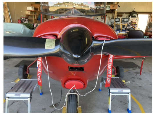
Zenith CH 601 XLB Engine Inlet Plugs