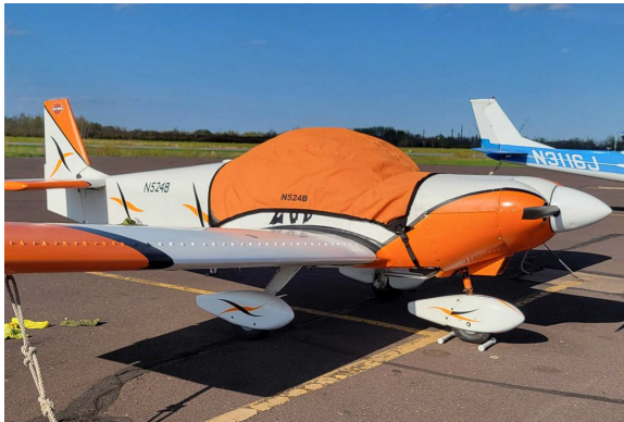
601 XL ZODIAC Canopy Cover