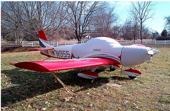
Zenith 601XL Canopy, Prop/Spinner and Insulated Engine Cover