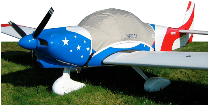
Zenith CH601 Canopy Cover