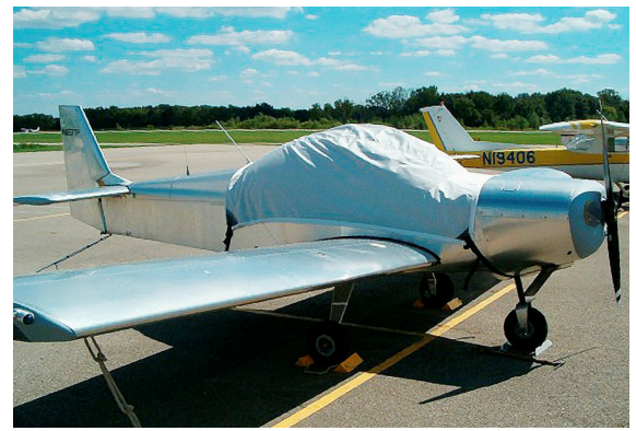
Zenith 650 Canopy Cover