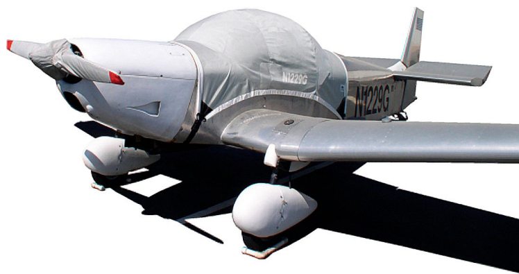
Zenith CH601 Canopy Cover & Prop Cover

This cover type is made from Silver Acrylic Sunbrella canvas and is 100% lined with a soft and smooth microfiber. Bruce's Custom Covers developed this material combination especially for aircraft protection. The outer material is medium weight and treated for water resistance, UV resistance and anti-static buildup. The inner lining is a very soft and smooth microfiber to prevent scratching. The material is very reflective, and tests show that the cabin interior temperature can be reduced to near-ambient temperature on the hottest of days. It is water, ice and snow repellent, yet breathable to allow moisture to escape from between the cover and the aircraft surface.