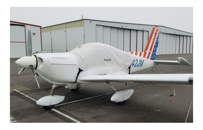
Zlin 242 Canopy Cover