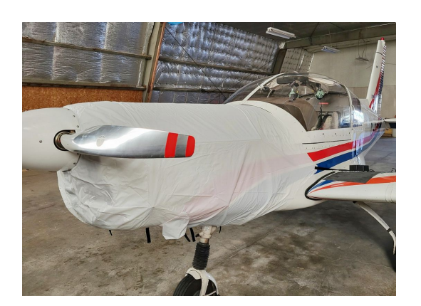
Zlin 142C Engine Cover, test fit cover