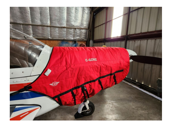
ZLIN 142C Insulated Engine Cover

This cover type is made from Silver Acrylic Sunbrella canvas and is 100% lined with a soft and smooth microfiber. Bruce's Custom Covers developed this material combination especially for aircraft protection. The outer material is medium weight and treated for water resistance, UV resistance and anti-static buildup. The inner lining is a very soft and smooth microfiber to prevent scratching. The material is very reflective, and tests show that the cabin interior temperature can be reduced to near-ambient temperature on the hottest of days. It is water, ice and snow repellent, yet breathable to allow moisture to escape from between the cover and the aircraft surface.