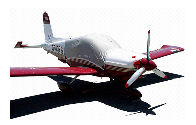
Zlin 143 Canopy Cover and Engine Plugs