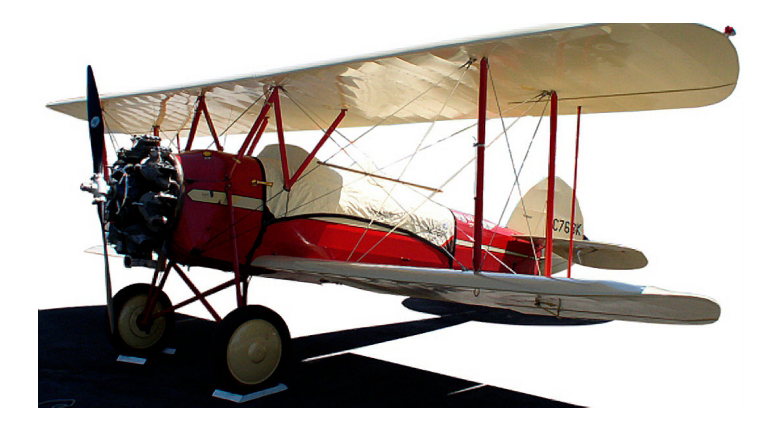
Waco 10 Canopy Cover