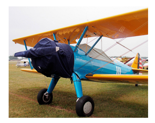
Stearman Canopy, Engine & Prop Covers

This cover type is made from Silver Acrylic Sunbrella canvas and is 100% lined with a soft and smooth microfiber. Bruce's Custom Covers developed this material combination especially for aircraft protection. The outer material is medium weight and treated for water resistance, UV resistance and anti-static buildup. The inner lining is a very soft and smooth microfiber to prevent scratching. The material is very reflective, and tests show that the cabin interior temperature can be reduced to near-ambient temperature on the hottest of days. It is water, ice and snow repellent, yet breathable to allow moisture to escape from between the cover and the aircraft surface.