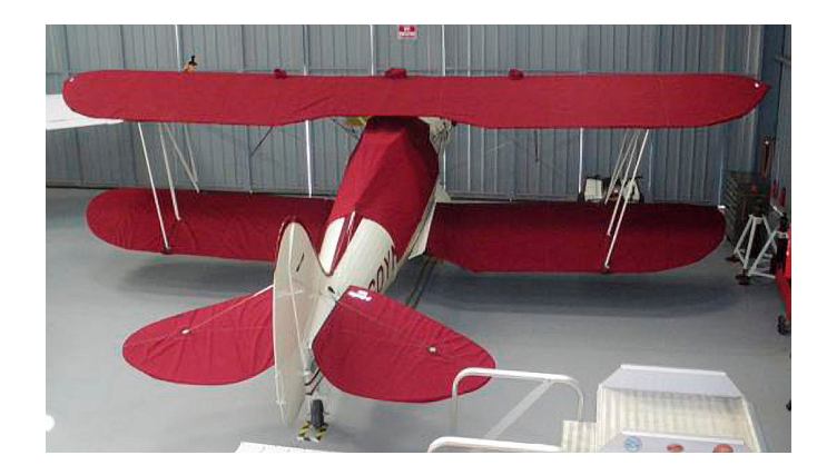
Waco UPF-7 Upper/Lower Wing Cover, Horizontal Stabilizer Cover, & Canopy Cover