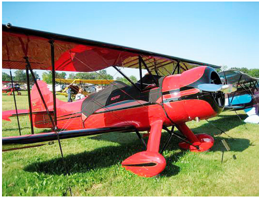
Waco UPF7 Canopy Cover