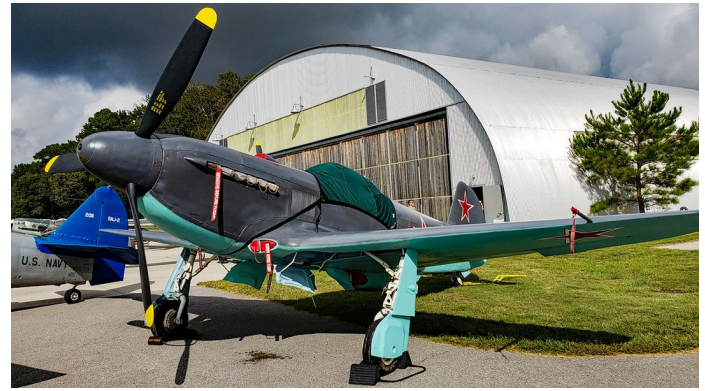
Yakovlev Yak 3 Oil Cooler Inlet Plugs (In Wing Root)