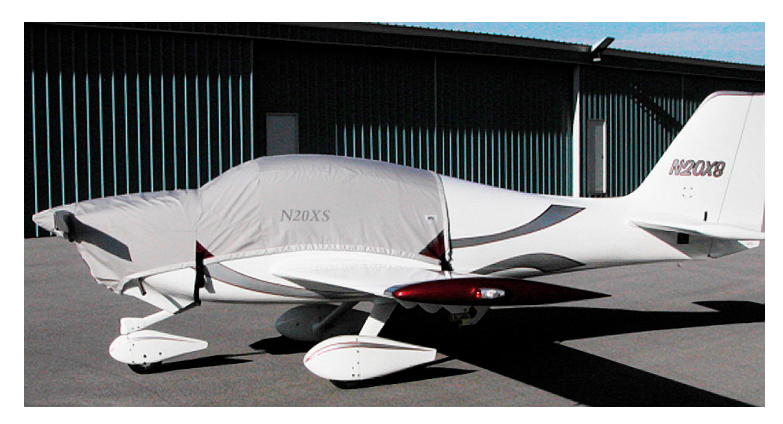
Canopy/Engine and Prop/Spinner Covers (tri-gear model)