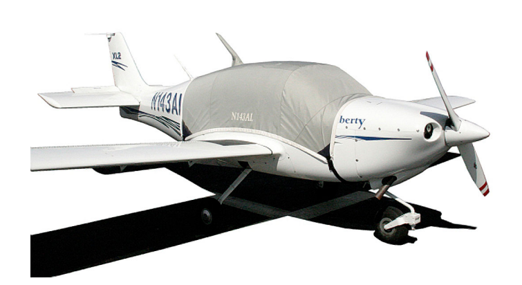
XL-2 Canopy Cover

This cover type is made from Silver Acrylic Sunbrella canvas and is 100% lined with a soft and smooth microfiber. Bruce's Custom Covers developed this material combination especially for aircraft protection. The outer material is medium weight and treated for water resistance, UV resistance and anti-static buildup. The inner lining is a very soft and smooth microfiber to prevent scratching. The material is very reflective, and tests show that the cabin interior temperature can be reduced to near-ambient temperature on the hottest of days. It is water, ice and snow repellent, yet breathable to allow moisture to escape from between the cover and the aircraft surface.