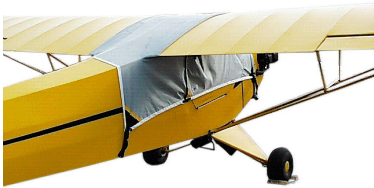
Piper J3 Over-Top Canopy Cover