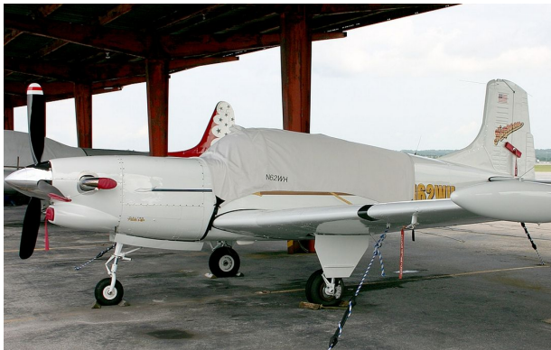
Beech Harpoon Canopy Cover, Exhaust Covers, Engine Plug

Prop Tie-Down/Exhaust Covers are made of heavy duty red vinyl material. Thick nylon webbing runs from the exhaust covers to the prop boot. This webbing is adjustable with plastic buckles, and is held tight with a steel spring where it attaches to the prop boot.