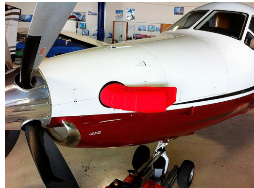
Pilatus PC-12 Exhaust Cover, Fully Enclosed, for protection against corrosion.