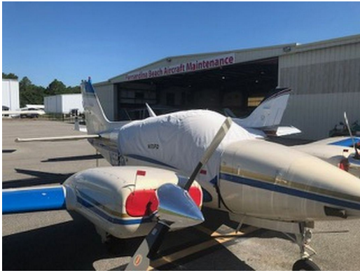
Beech Baron 95-B55 Canopy cover

the hottest of days. It is water, ice and snow repellent, yet breathable to allow moisture to escape from between the cover and the aircraft surface.