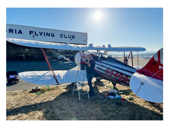
Waco YMF-5 Engine, Extended Canopy, Wing Covers & Horizontal Stab Covers