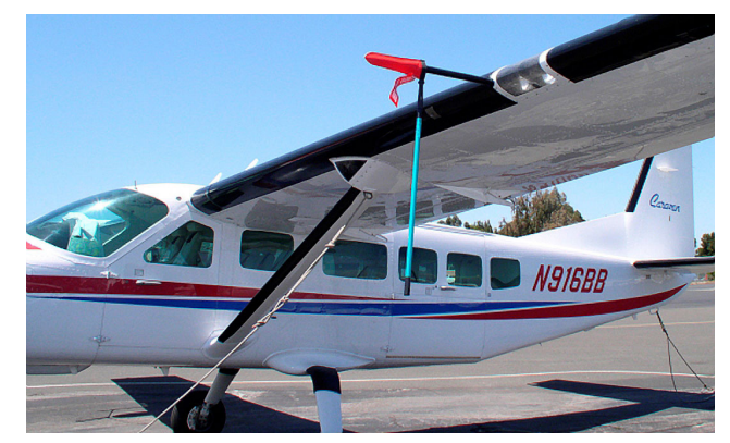
Cessna 208 Caravan Telescoping Pitot (for amphib. models)

Waco YMF-5 Pitot Tube Covers , NOT HEAT RESISTANT TYPE, are made of Naugahyde vinyl, and are designed to cover the entire pitot assembly. Slipping over the tube, the cover tightens around the base with a Velcro strap detail. A "Remove Before Flight" streamer is attached to the cover. Heat Resistant Pitot Covers are an upgrade to this design, and help prevent the pitot cover from melting onto the tube if the pitot heat is accidentally turned on while installed. If you want the set tethered together, please let us know.