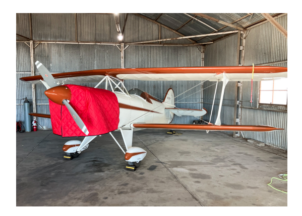
RIA FLYING CLUB