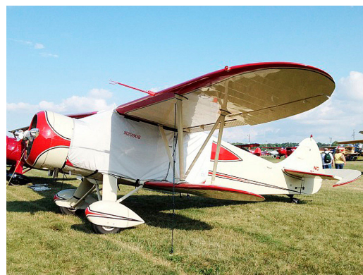
Waco AGC-8 Over-the-Top Canopy Cover