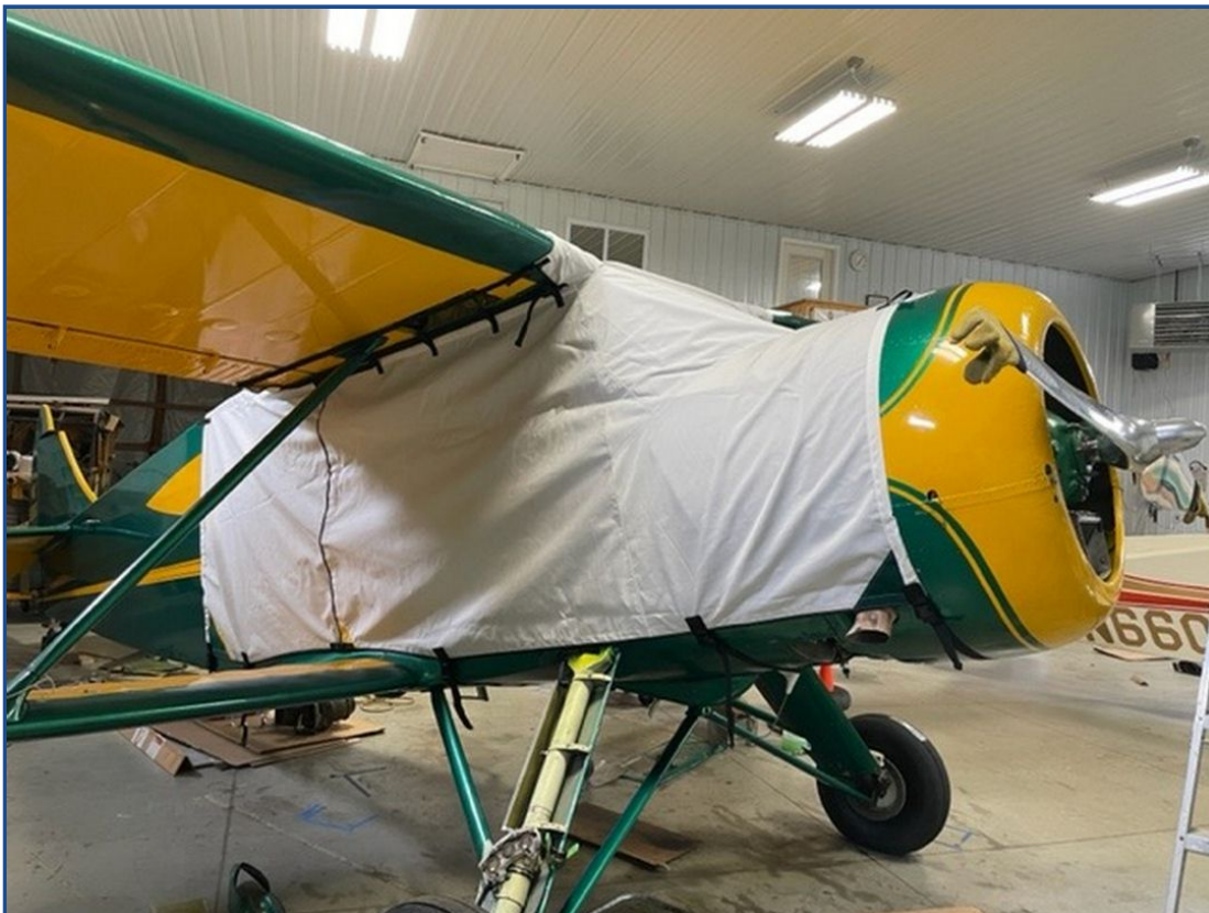
Waco Cabin Biplane Cabin Cover (Over Top Type), Ext. To Cover Baggage Door