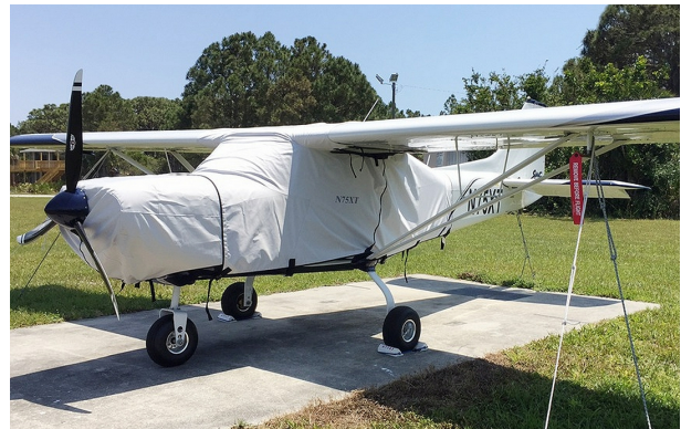
World Aircraft Extended Canopy Cover & Engine Cover