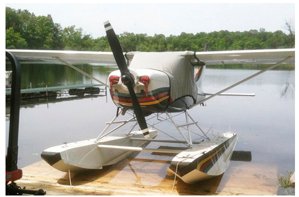
Glastar Sportsman Canopy Cover and Engine Plugs