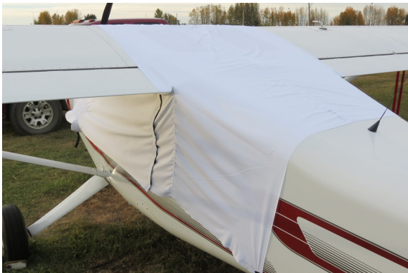
Pelican Canopy Cover (test fit cover)

This cover type is made from Silver Acrylic Sunbrella canvas and is 100% lined with a soft and smooth microfiber. Bruce's Custom Covers developed this material combination especially for aircraft protection. The outer material is medium weight and treated for water resistance, UV resistance and anti-static buildup. The inner lining is a very soft and smooth microfiber to prevent scratching. The material is very reflective, and tests show that the cabin interior temperature can be reduced to near-ambient temperature on the hottest of days. It is water, ice and snow repellent, yet breathable to allow moisture to escape from between the cover and the aircraft surface.