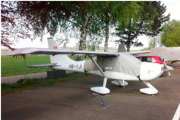
OMF Symphony Canopy, Wings, Horiz. Stab, and Prop Covers

This cover type is made from Silver Acrylic Sunbrella canvas and is 100% lined with a soft and smooth microfiber. Bruce's Custom Covers developed this material combination especially for aircraft protection. The outer material is medium weight and treated for water resistance, UV resistance and anti-static buildup. The inner lining is a very soft and smooth microfiber to prevent scratching. The material is very reflective, and tests show that the cabin interior temperature can be reduced to near-ambient temperature on the hottest of days. It is water, ice and snow repellent, yet breathable to allow moisture to escape from between the cover and the aircraft surface.