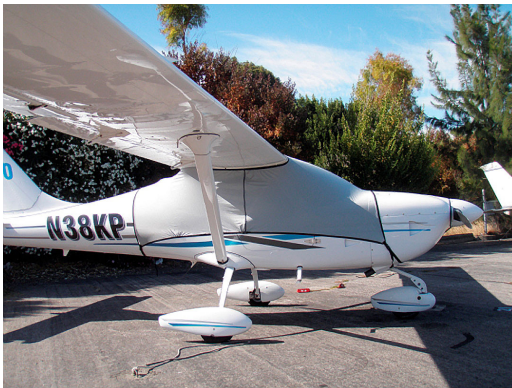
Glstar Spandex FlyAway Travel Canopy Cover

This cover type is made from Silver Acrylic Sunbrella canvas and is 100% lined with a soft and smooth microfiber. Bruce's Custom Covers developed this material combination especially for aircraft protection. The outer material is medium weight and treated for water resistance, UV resistance and anti-static buildup. The inner lining is a very soft and smooth microfiber to prevent scratching. The material is very reflective, and tests show that the cabin interior temperature can be reduced to near-ambient temperature on the hottest of days. It is water, ice and snow repellent, yet breathable to allow moisture to escape from between the cover and the aircraft surface.