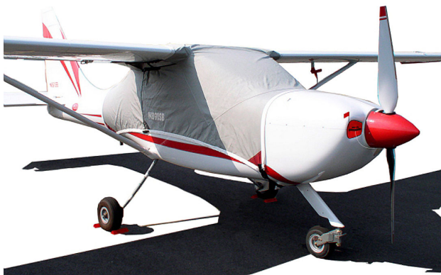
Glastar Over-Top Canopy Cover