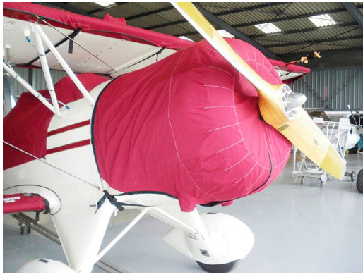
Waco UPF-7 Engine Cover