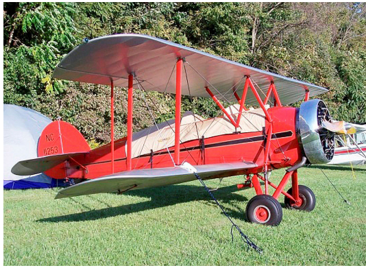
Waco ASO Canopy Cover