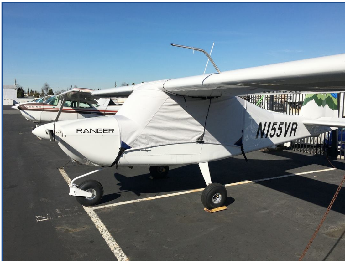
Vashon Ranger R7 Canopy Cover, Over-Top Type