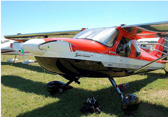
Glastar Sportsman Windshield HeatShield