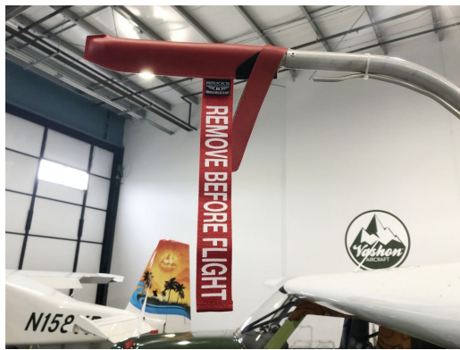
Vashon Ranger R7 Pitot Cover