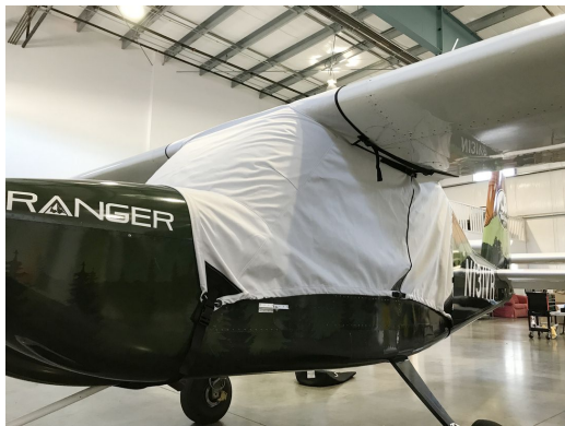
Vashon Ranger R7 Canopy Cover