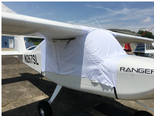
Vashon Ranger VR-7 Canopy Cover, test fit cover