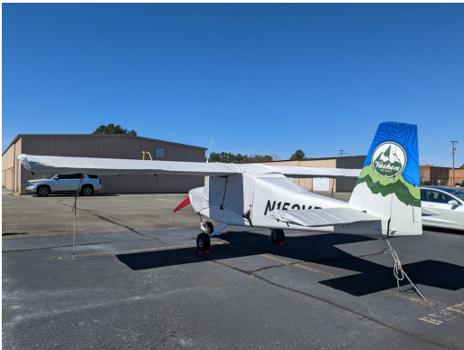
Vashon R7 Ranger Canopy/Engine, Wing & Horiz. Stab. Covers, fully enclosed

WINTER USE MATERIAL - Made with Solution-Dyed Polyester fabric, this option is intended for seasonal use to aid in deicing, rain mitigation, or for occasional travel. The material is lighter and more compact, but more susceptible to UV damage and may have a shorter useful life if used continuously outside than the all-year use material.