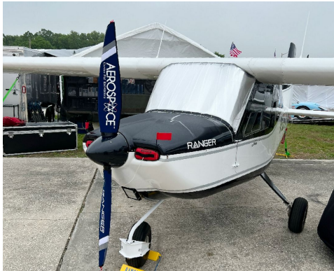
Vashon Ranger Engine Inlet Plugs

foam with a silver mylar finish. The semi-rigid design is stiff enough to stand along the inside of the windshield using sun visors or window framing. It folds up flat and easily stores in the included storage sleeve. Some designs may require velcro and suction cups or split right and left sides. A Heatshield is an excellent short-term remedy for cockpit overheating. An external fabric cover is far more effective and practical for long-term protection.