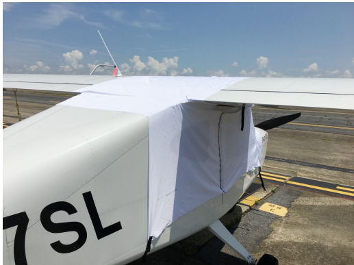
Vashon Ranger VR-7 Canopy Cover, test fit cover

Travel Covers are made with Silver Solution-Dyed Polyester fabric and only lined over the windshield to save weight. The material is lightweight and more compact for easy stowage in the aircraft. The polyester material is water resistant, but only intended for occasional use outside. We also have an ultra lightweight material available for fitted hangar dust covers. For daily outdoor use, the non-travel Sunbrella Cover is the best choice.