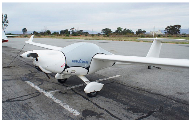
Lambda Canopy Cover