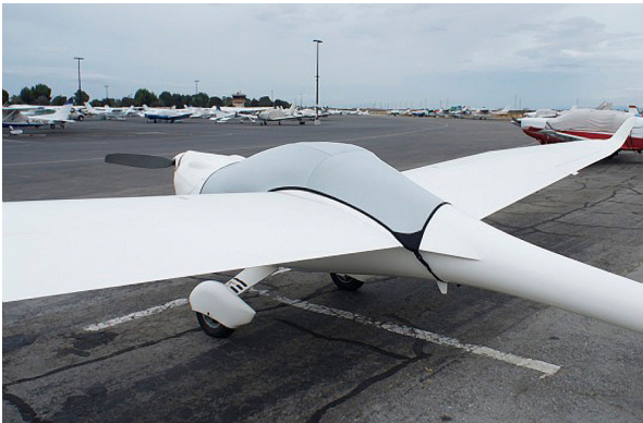
Lambada Canopy/Engine Cover and Wing Covers