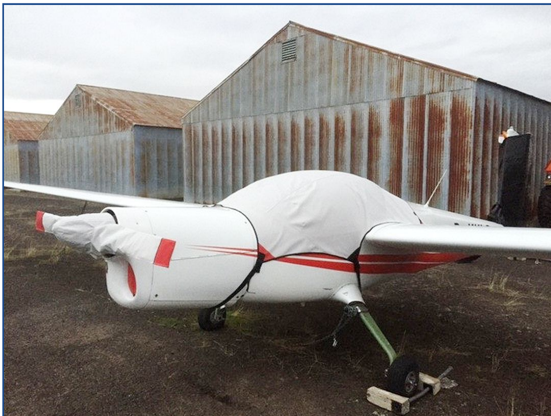
Vivat Canopy and Prop/Spinner Cover