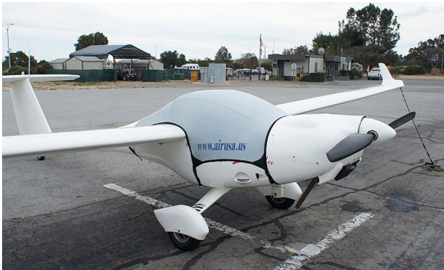
Lambada Travel Canopy Cover