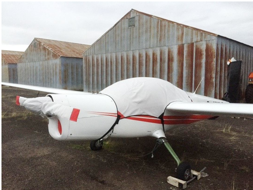
Vivat Canopy and Prop/Spinner Cover