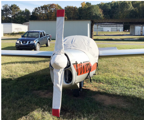
Aerotechnik L-13 Vivat Motorglider Prop/Spinner & Canopy Covers