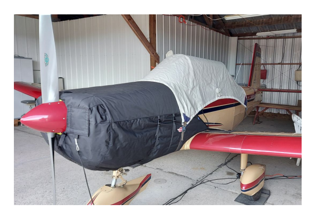
Varga 2150A Insulated Engine Cover, Canopy Cover