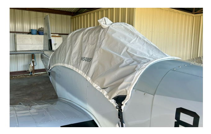
Varga Kachina Travel Cover, Light Weight Canopy Cover