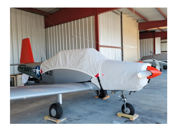
Varga Kachina Canopy & Engine Covers

This cover type is made from Silver Acrylic Sunbrella canvas and is 100% lined with a soft and smooth microfiber. Bruce's Custom Covers developed this material combination especially for aircraft protection. The outer material is medium weight and treated for water resistance, UV resistance and anti-static buildup. The inner lining is a very soft and smooth microfiber to prevent scratching. The material is very reflective, and tests show that the cabin interior temperature can be reduced to near-ambient temperature on the hottest of days. It is water, ice and snow repellent, yet breathable to allow moisture to escape from between the cover and the aircraft surface.