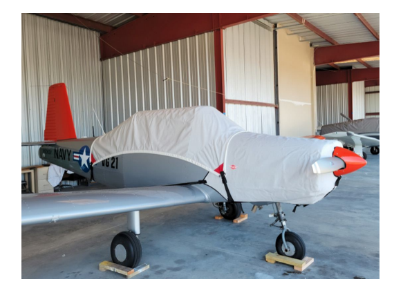
Varga Kachina Canopy & Engine Covers