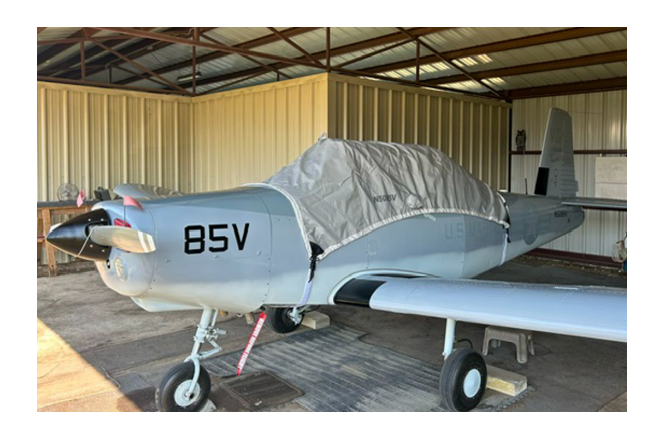
Varga Kachina Travel Cover, Light Weight Canopy Cover

Travel Covers are made with Silver Solution-Dyed Polyester fabric and only lined over the windshield to save weight. The material is lightweight and more compact for easy stowage in the aircraft. The polyester material is water resistant, but only intended for occasional use outside. We also have an ultra lightweight material available for fitted hangar dust covers. For daily outdoor use, the non-travel Sunbrella Cover is the best choice.