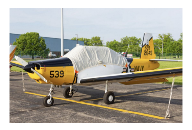
Varga Kachina Canopy Cover

This cover type is made from Silver Acrylic Sunbrella canvas and is 100% lined with a soft and smooth microfiber. Bruce's Custom Covers developed this material combination especially for aircraft protection. The outer material is medium weight and treated for water resistance, UV resistance and anti-static buildup. The inner lining is a very soft and smooth microfiber to prevent scratching. The material is very reflective, and tests show that the cabin interior temperature can be reduced to near-ambient temperature on the hottest of days. It is water, ice and snow repellent, yet breathable to allow moisture to escape from between the cover and the aircraft surface.