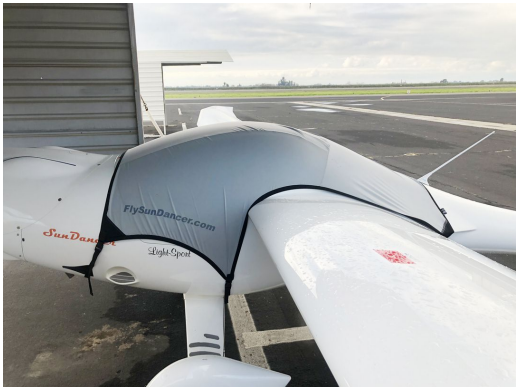
SUNDANCER Travel Cover with custom Imprint