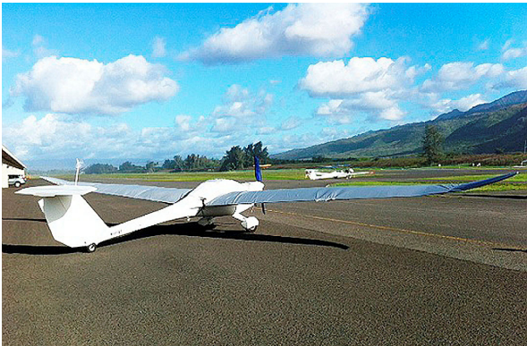
Distar Sundancer LSA Extended Canopy/Engine, Prop, Wheelpants, Wings & Empennage Covers Lambada Canopy/Engine Cover and Wing Covers