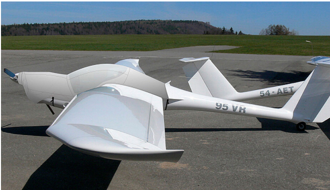
Lambda Canopy/Engine Cover (illustration)