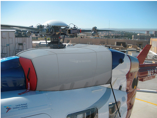
Bubble Cover w/ nose mounted radome, Upper Deck Plugs/Cover Upper Deck Plugs/Cover, extended to cover aft intake vents