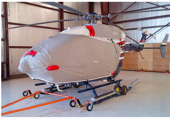
Bubble Cover w/ nose mounted radome & Upper Deck Plugs/Cover