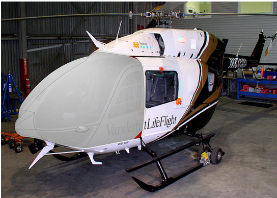
EC-145 Windshield/Nose Cover (illustration)