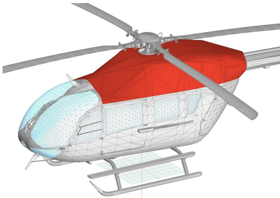
Intake/Exhaust Engine Area Cover, 3D Rendering