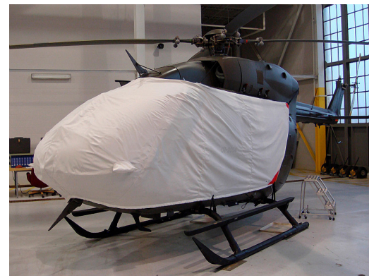
EC-145 Bubble Cover