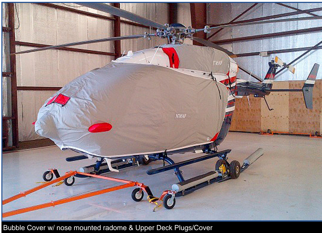
Bubble Cover w/ nose mounted radome &amp; Upper Deck Plugs/Cover