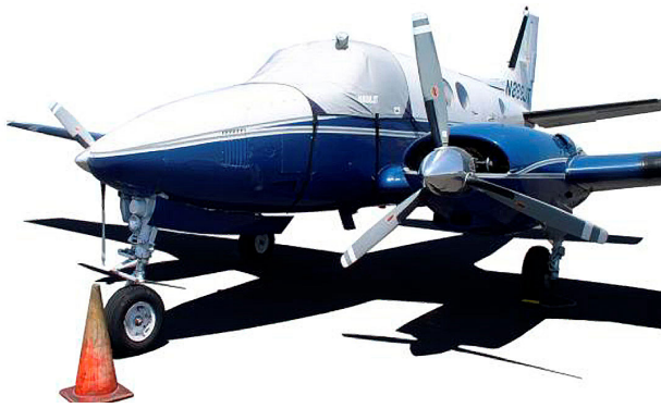
King Air Cockpit Cover, belly-strap type