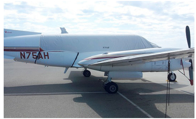
King Air 350 Canopy Cover