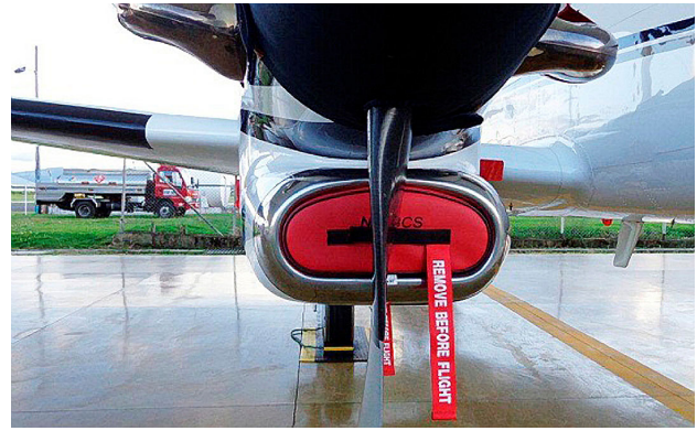
Beech King Air C90B Main Engine Inlet Plug