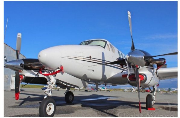
King Air C90A Engine Plugs and Pitot Covers