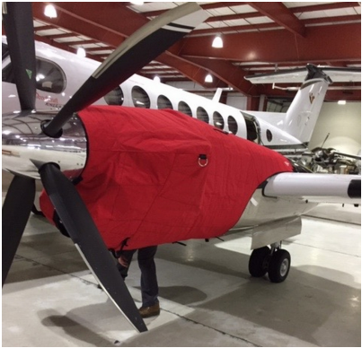
Beech King Air 200 Insulated Engine Cover

The material is very reflective, and tests show that the cabin interior temperature can be reduced to near-ambient temperature on the hottest of days. It is water, ice and snow repellent, yet breathable to allow moisture to escape from between the cover and the aircraft surface.