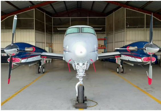
Beech King Air Prop Tie-Downs/Exhaust Covers