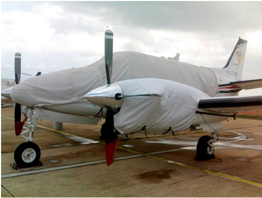
King Air C90 Canopy/Nose Cover, Engine Covers