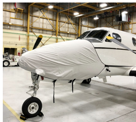
King Air 200 Nose Cover