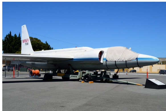
Lockheed U-2 Cockpit Cover