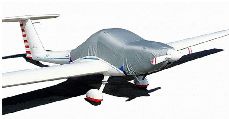
Grob 109 Canopy/Engine Cover