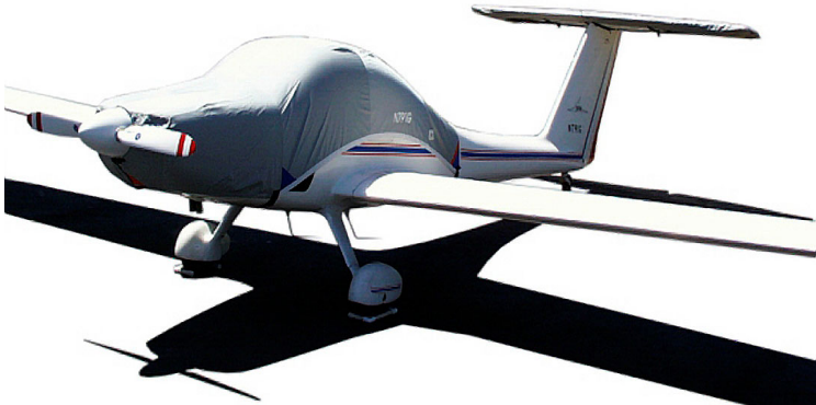
Grob 109 Canopy/Engine Cover & Horiz. Stabilizer Cover