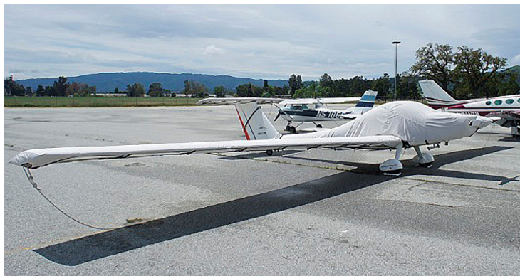
Grob 109 Canopy/Engine w/ extension to tail, Wing, Stabilizer & Prop/Spinner Covers