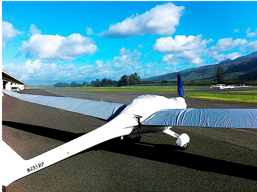
Lambda Canopy/Engine Cover and Wing Covers

WINTER USE MATERIAL - Made with Solution-Dyed Polyester fabric, this option is intended for seasonal use to aid in deicing, rain mitigation, or for occasional travel. The material is lighter and more compact, but more susceptible to UV damage and may have a shorter useful life if used continuously outside than the all-year use material.