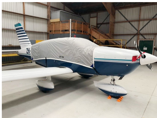
Socata TB-9 TRAVEL COVER, Light Weight Canopy Cover

Travel Covers are made with Silver Solution-Dyed Polyester fabric and only lined over the windshield to save weight. The material is lightweight and more compact for easy stowage in the aircraft. The polyester material is water resistant, but only intended for occasional use outside. We also have an ultra lightweight material available for fitted hangar dust covers. For daily outdoor use, the non-travel Sunbrella Cover is the best choice.