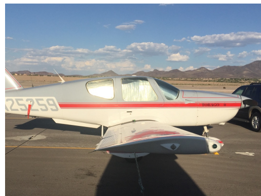
Socata TB-10 Cabin HeatShields