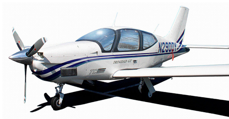
Socata TB20 HeatShields

Windshield Heatshields are interior sunshades for an aircraft's front windshield. The product is a unique composite of closed-cell foam with a silver mylar finish. The semi-rigid design is stiff enough to stand along the inside of the windshield using sun visors or window framing. It folds up flat and easily stores in the included storage sleeve. Some designs may require velcro and suction cups or split right and left sides. A Heatshield is an excellent short-term remedy for cockpit overheating. An external fabric cover is far more effective and practical for long-term protection.