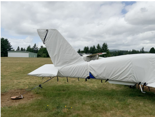
Socata Tampico TB-9C Cover Set