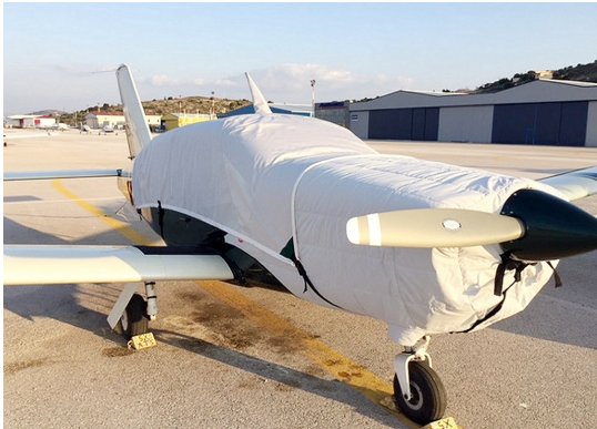
Socata TB-20 Canopy Cover, Insulated Engine Cover

This cover type is made from Silver Acrylic Sunbrella canvas and is 100% lined with a soft and smooth microfiber. Bruce's Custom Covers developed this material combination especially for aircraft protection. The outer material is medium weight and treated for water resistance, UV resistance and anti-static buildup. The inner lining is a very soft and smooth microfiber to prevent scratching. The material is very reflective, and tests show that the cabin interior temperature can be reduced to near-ambient temperature on the hottest of days. It is water, ice and snow repellent, yet breathable to allow moisture to escape from between the cover and the aircraft surface.