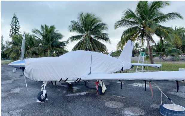
Socata Trinidad Full Cover Set