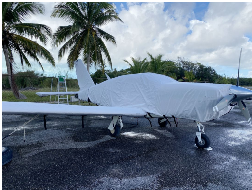
Socata Trinidad Full Cover Set

WINTER USE MATERIAL - Made with Solution-Dyed Polyester fabric, this option is intended for seasonal use to aid in deicing, rain mitigation, or for occasional travel. The material is lighter and more compact, but more susceptible to UV damage and may have a shorter useful life if used continuously outside than the all-year use material.