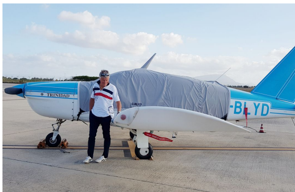
Socata Tampico, Tobago & Trinidad Travel Cover, Light Weight Canopy Cover