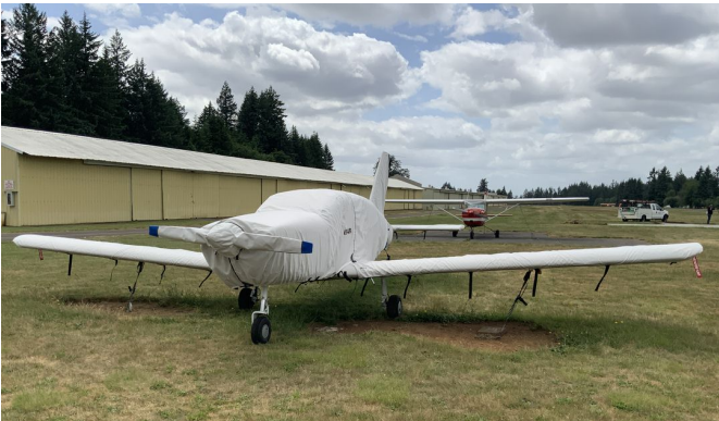
Socata Tampico TB-9C Cover Set