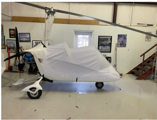
MTO Sport Gyrocopter Canopy/Nose Cover, test fit cover