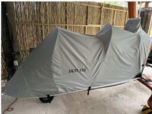
MTO Sport Travel Weight Canopy/Nose Cover

Travel Covers are made with Silver Solution-Dyed Polyester fabric and fully lined over the entire cover. The material is lightweight and more compact for easy stowage in the aircraft. The polyester material is water resistant, but only intended for occasional use outside. We also have an ultra lightweight material available for fitted hangar dust covers. For daily outdoor use, the non-travel Sunbrella Cover is the best choice.