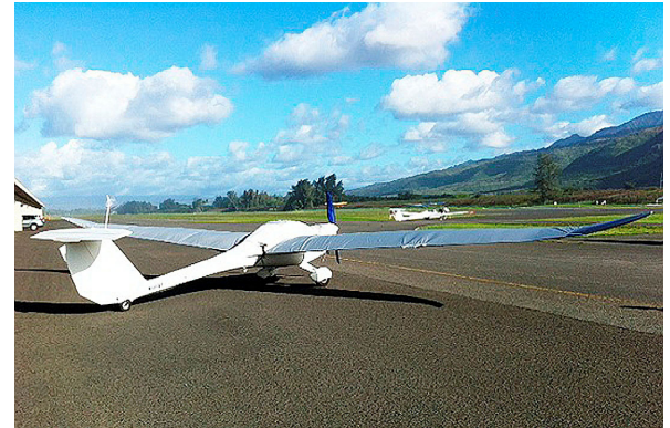
Grob 109 Canopy/Engine w/ extension to tail, Wing, Stabilizer & Prop/Spinner Covers Lambada Canopy/Engine Cover and Wing Covers