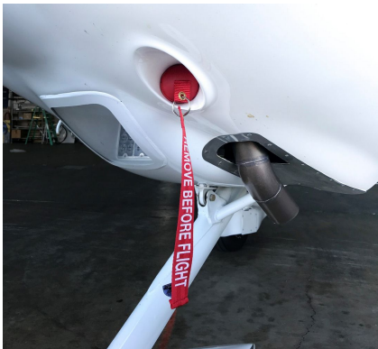
Tecnam Engine Plugs, set of 5

Engine Inlet Plugs are custom fit for your Tecnam P92 Eaglet intakes, made with heavy-duty vinyl material, and stuffed with a single block of sculpted urethane foam. Each plug has a zipper that allows the foam to be removed and dried if necessary. Engine plugs have warning flags that are visible from the cockpit or 'remove before flight' streamers sewn onto the face of the plugs. Most plugs are imprinted with the aircraft registration number in black for an extra charge. Storage bag NOT included. Engine plugs may be inserted after flight when the engine is still warm. Engine Inlet Plugs are commonly referred to as Cowl Plugs, Intake Plugs, Cowl Blocks, Engine Blocks, and Engine Bungs.