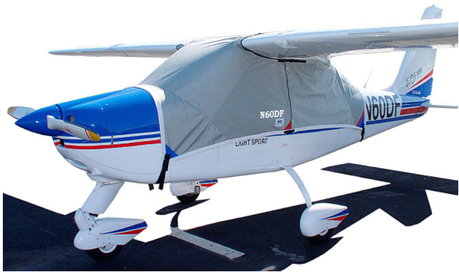
Tecnam Bravo Canopy Cover