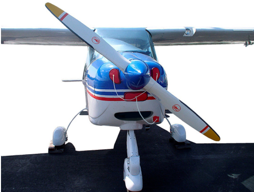
Tecnam Bravo Engine Plugs