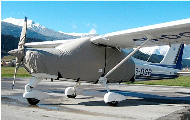
Tecnam Echo Extended Canopy, Engine, Prop Covers

This cover type is made from Silver Acrylic Sunbrella canvas and is 100% lined with a soft and smooth microfiber. Bruce's Custom Covers developed this material combination especially for aircraft protection. The outer material is medium weight and treated for water resistance, UV resistance and anti-static buildup. The inner lining is a very soft and smooth microfiber to prevent scratching. The material is very reflective, and tests show that the cabin interior temperature can be reduced to near-ambient temperature on the hottest of days. It is water, ice and snow repellent, yet breathable to allow moisture to escape from between the cover and the aircraft surface.