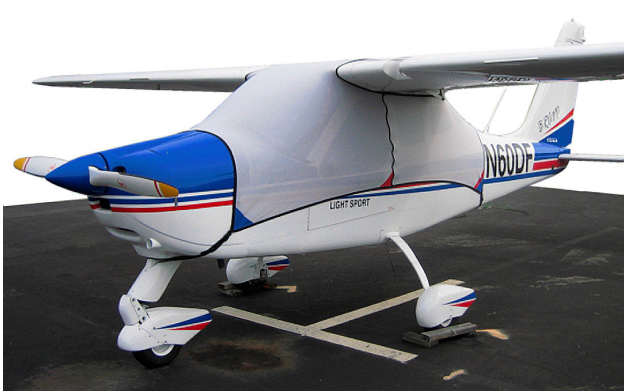
Tecnam Bravo Spandex FlyAway Travel Canopy Cover

occasional use outside. We also have an ultra lightweight material available for fitted hangar dust covers. For daily outdoor use, the non-travel Sunbrella Cover is the best choice.