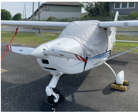
Tecnam P92 EAGLET Canopy Cover Over theTop Style