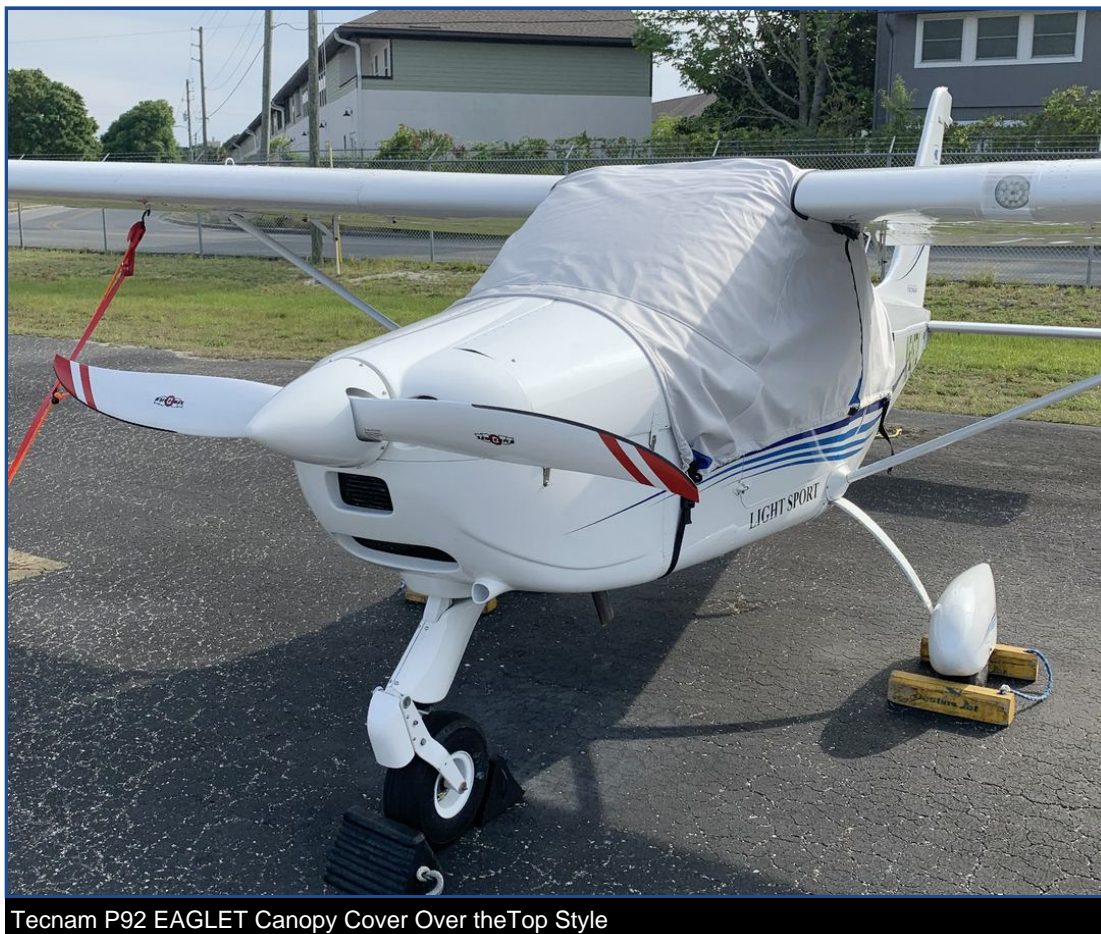
Tecnam P92 EAGLET Canopy Cover Over theTop Style