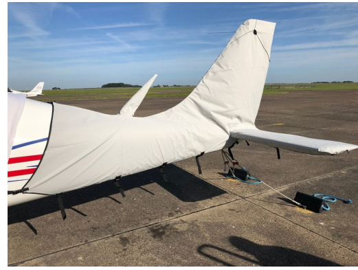
Tecnam P2010 Wing, Empennage & Prop Covers