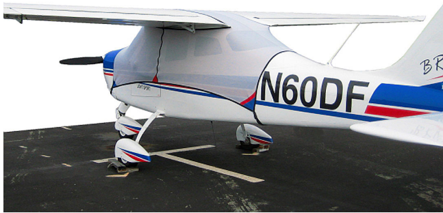
Tecnam Bravo Spandex FlyAway Travel Canopy Cover

The material is very reflective, and tests show that the cabin interior temperature can be reduced to near-ambient temperature on the hottest of days. It is water, ice and snow repellent, yet breathable to allow moisture to escape from between the cover and the aircraft surface.