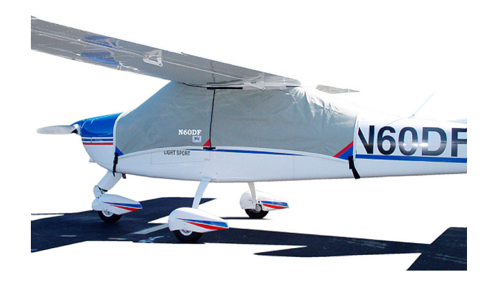
Tecnam Bravo Canopy Cover