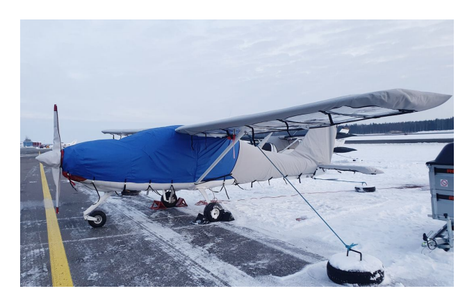
Tecnam P2010 Wing, Empennage & Prop Covers

WINTER USE MATERIAL - Made with Solution-Dyed Polyester fabric, this option is intended for seasonal use to aid in deicing, rain mitigation, or for occasional travel. The material is lighter and more compact, but more susceptible to UV damage and may have a shorter useful life if used continuously outside than the all-year use material.