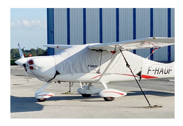
Tecnam P2010 Over-Top Canopy Cover, Engine Plugs