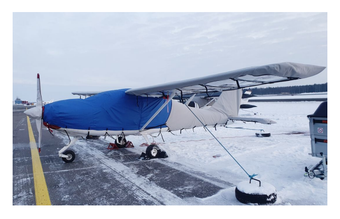
Tecnam P2010 Wing, Empennage & Prop Covers