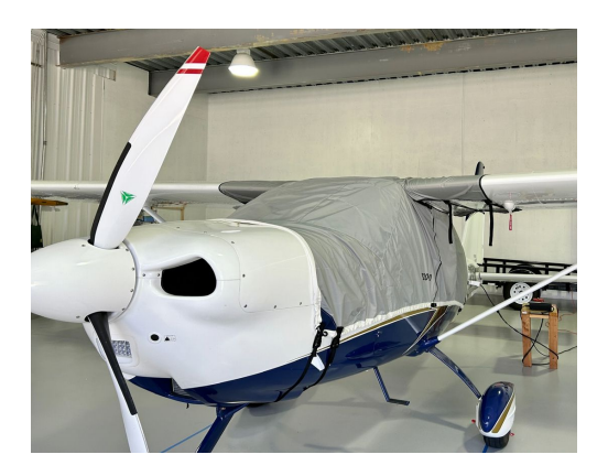
Tecnam P2010 Lightweight Travel Canopy Cover

lightweight and more compact for easy stowage in the aircraft. The polyester material is water resistant, but only intended for occasional use outside. We also have an ultra lightweight material available for fitted hangar dust covers. For daily outdoor use, the non-travel Sunbrella Cover is the best choice.