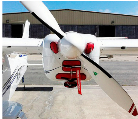
Tecnam P2006T Engine Plugs

Engine Inlet Plugs are custom fit for your Tecnam P2006T Twin intakes, made with heavy-duty vinyl material, and stuffed with a single block of sculpted urethane foam. Each plug has a zipper that allows the foam to be removed and dried if necessary. Engine plugs have warning flags that are visible from the cockpit or 'remove before flight' streamers sewn onto the face of the plugs. Most plugs are imprinted with the aircraft registration number in black for an extra charge. Storage bag NOT included. Engine plugs may be inserted after flight when the engine is still warm. Engine Inlet Plugs are commonly referred to as Cowl Plugs, Intake Plugs, Cowl Blocks, Engine Blocks, and Engine Bungs.