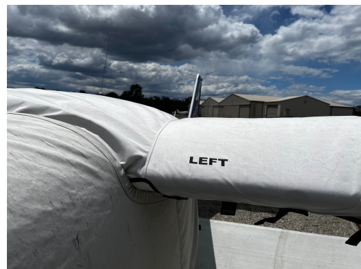
Tecnam P2006T Twin Wing & Engine Covers, All Year Use