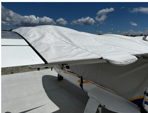
Tecnam P2006T Twin Wing & Engine Covers, All Year Use

WINTER USE MATERIAL - Made with Solution-Dyed Polyester fabric, this option is intended for seasonal use to aid in deicing, rain mitigation, or for occasional travel. The material is lighter and more compact, but more susceptible to UV damage and may have a shorter useful life if used continuously outside than the all-year use material.