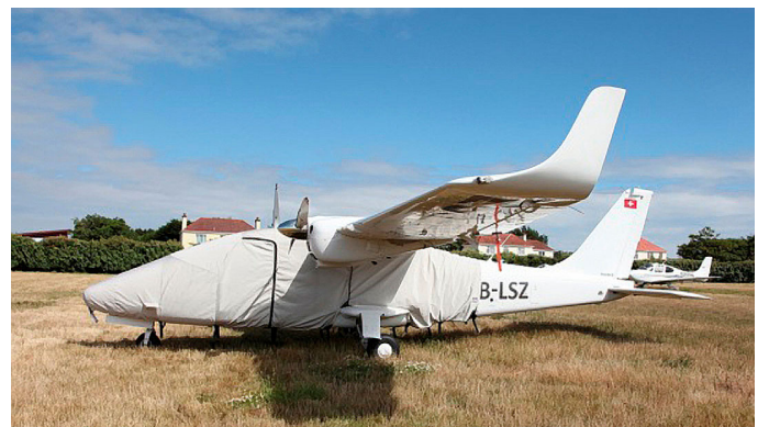
Tecnam Twin Extended Canopy/Nose Cover