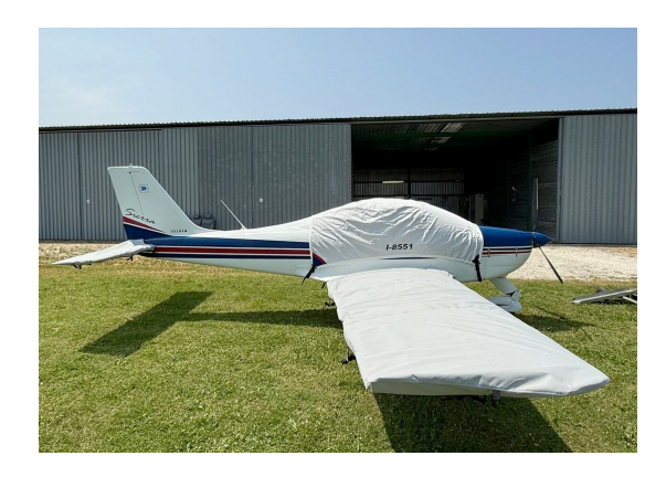
Tecnam P2002 Sierra Canopy, Wing & Horizontal Stabilizer Covers

WINTER USE MATERIAL - Made with Solution-Dyed Polyester fabric, this option is intended for seasonal use to aid in deicing, rain mitigation, or for occasional travel. The material is lighter and more compact, but more susceptible to UV damage and may have a shorter useful life if used continuously outside than the all-year use material.