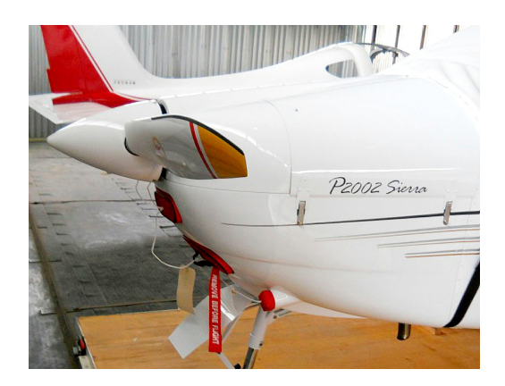
Tecnam Sierra Engine Inlet Plugs set

Engine Inlet Plugs are custom fit for your Tecnam P2002 Sierra, P96 Golf, P-Mentor intakes, made with heavy-duty vinyl material, and stuffed with a single block of sculpted urethane foam. Each plug has a zipper that allows the foam to be removed and dried if necessary. Engine plugs have warning flags that are visible from the cockpit or 'remove before flight' streamers sewn onto the face of the plugs. Most plugs are imprinted with the aircraft registration number in black for an extra charge. Storage bag NOT included. Engine plugs may be inserted after flight when the engine is still warm. Engine Inlet Plugs are commonly referred to as Cowl Plugs, Intake Plugs, Cowl Blocks, Engine Blocks, and Engine Bungs.