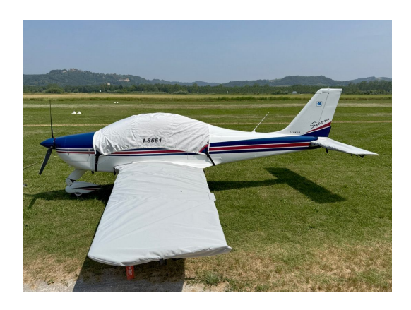
Tecnam P2002 Sierra Canopy, Wing & Horizontal Stabilizer Covers