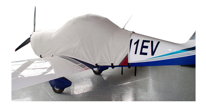
Evektor Sportstar Extended Canopy/Engine Cover

This cover type is made from Silver Acrylic Sunbrella canvas and is 100% lined with a soft and smooth microfiber. Bruce's Custom Covers developed this material combination especially for aircraft protection. The outer material is medium weight and treated for water resistance, UV resistance and anti-static buildup. The inner lining is a very soft and smooth microfiber to prevent scratching. The material is very reflective, and tests show that the cabin interior temperature can be reduced to near-ambient temperature on the hottest of days. It is water, ice and snow repellent, yet breathable to allow moisture to escape from between the cover and the aircraft surface.