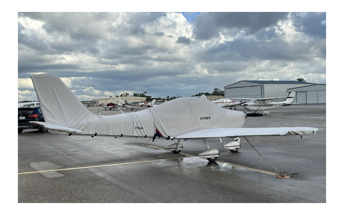
Tecnam P2002 Sierra Complete Cover Set