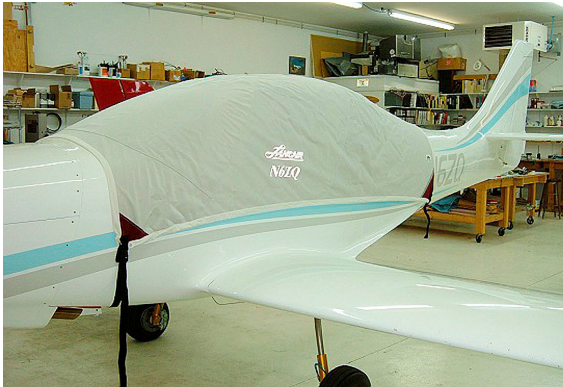
Lancair 320 Standard Canopy Cover

This cover type is made from Silver Acrylic Sunbrella canvas and is 100% lined with a soft and smooth microfiber. Bruce's Custom Covers developed this material combination especially for aircraft protection. The outer material is medium weight and treated for water resistance, UV resistance and anti-static buildup. The inner lining is a very soft and smooth microfiber to prevent scratching. The material is very reflective, and tests show that the cabin interior temperature can be reduced to near-ambient temperature on the hottest of days. It is water, ice and snow repellent, yet breathable to allow moisture to escape from between the cover and the aircraft surface.