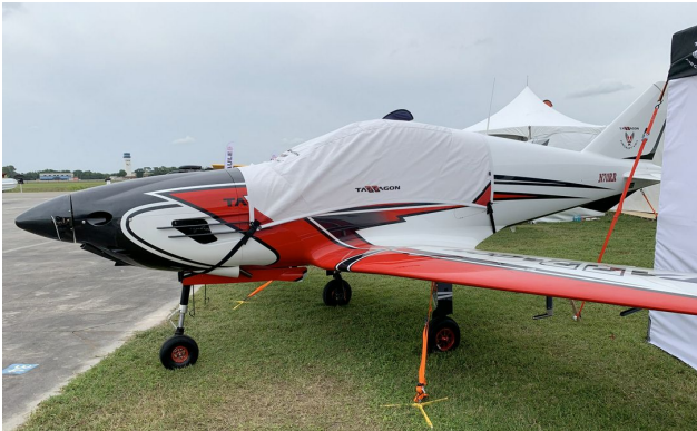
Pelegrin Tarragon Canopy Cover