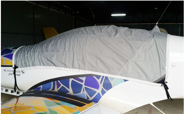
Blackshape Prime Travel Cover, Light Weight Travel Canopy Cover