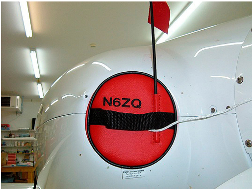
Lancair 320 Engine Inlet Plugs

Engine Inlet Plugs are custom fit for your Flying Legend Tucano R intakes, made with heavy-duty vinyl material, and stuffed with a single block of sculpted urethane foam. Each plug has a zipper that allows the foam to be removed and dried if necessary. Engine plugs have warning flags that are visible from the cockpit or 'remove before flight' streamers sewn onto the face of the plugs. Most plugs are imprinted with the aircraft registration number in black for an extra charge. Storage bag NOT included. Engine plugs may be inserted after flight when the engine is still warm. Engine Inlet Plugs are commonly referred to as Cowl Plugs, Intake Plugs, Cowl Blocks, Engine Blocks, and Engine Bungs.