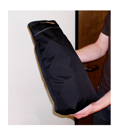
Light Weight Travel-Cover Mini-Storage Bag: 18" x 6" x 4"