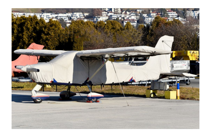
Tecnam P92 Echo Complete Cover Set

WINTER USE MATERIAL - Made with Solution-Dyed Polyester fabric, this option is intended for seasonal use to aid in deicing, rain mitigation, or for occasional travel. The material is lighter and more compact, but more susceptible to UV damage and may have a shorter useful life if used continuously outside than the all-year use material.