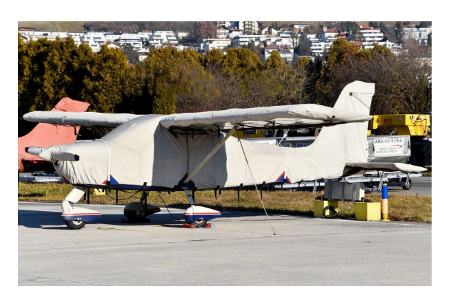
Tecnam P92 Echo Complete Cover Set