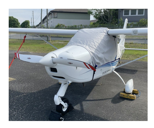
Tecnam P92 EAGLET Canopy Cover Over the Top Style

Travel Covers are made with Silver Solution-Dyed Polyester fabric and only lined over the windshield to save weight. The material is lightweight and more compact for easy stowage in the aircraft. The polyester material is water resistant, but only intended for occasional use outside. We also have an ultra lightweight material available for fitted hangar dust covers. For daily outdoor use, the non-travel Sunbrella Cover is the best choice.