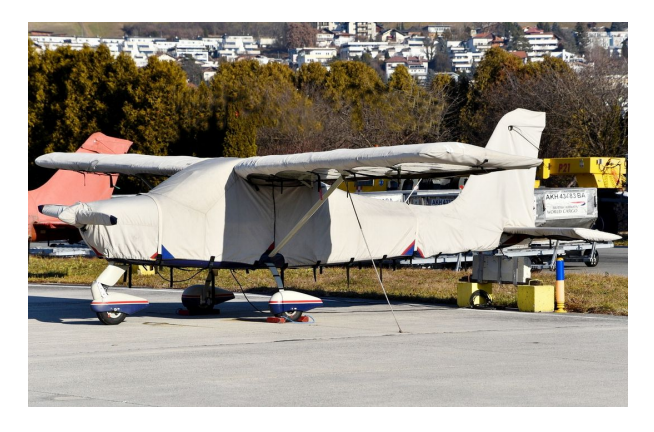
Tecnam P92 Echo Complete Cover Set