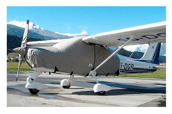
Tecnam Echo Extended Canopy, Engine, Prop Covers