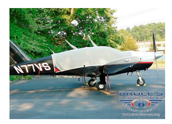
Socata TB20 Canopy Cover

This cover type is made from Silver Acrylic Sunbrella canvas and is 100% lined with a soft and smooth microfiber. Bruce's Custom Covers developed this material combination especially for aircraft protection. The outer material is medium weight and treated for water resistance, UV resistance and anti-static buildup. The inner lining is a very soft and smooth microfiber to prevent scratching. The material is very reflective, and tests show that the cabin interior temperature can be reduced to near-ambient temperature on the hottest of days. It is water, ice and snow repellent, yet breathable to allow moisture to escape from between the cover and the aircraft surface.