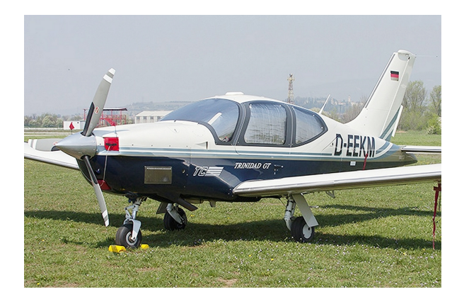
TB-9 Engine Plugs and HeatShields

Cowl Blocks, Engine Blocks, and Engine Bungs.