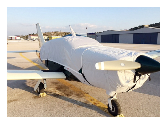
Socata TB-20 Canopy Cover, Insulated Engine Cover