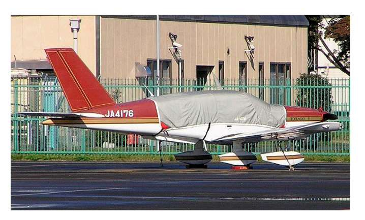
Socata TB-10 Tampico Canopy Cover