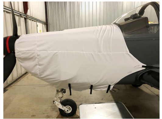
Socata Epsilon TB-30 Insulated Engine Cover, test fit cover

This cover type is made from Silver Acrylic Sunbrella canvas and is 100% lined with a soft and smooth microfiber. Bruce's Custom Covers developed this material combination especially for aircraft protection. The outer material is medium weight and treated for water resistance, UV resistance and anti-static buildup. The inner lining is a very soft and smooth microfiber to prevent scratching. The material is very reflective, and tests show that the cabin interior temperature can be reduced to near-ambient temperature on the hottest of days. It is water, ice and snow repellent, yet breathable to allow moisture to escape from between the cover and the aircraft surface.