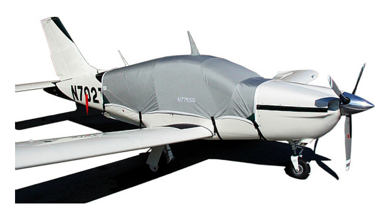
TB20 Standard Canopy Cover

Travel Covers are made with Silver Solution-Dyed Polyester fabric and only lined over the windshield to save weight. The material is lightweight and more compact for easy stowage in the aircraft. The polyester material is water resistant, but only intended for occasional use outside. We also have an ultra lightweight material available for fitted hangar dust covers. For daily outdoor use, the non-travel Sunbrella Cover is the best choice.