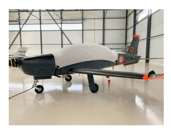
Socata TB-30 Epsilon Canopy Cover