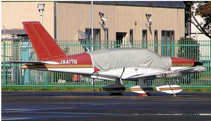
Socata TB-10 Tampico Canopy Cover