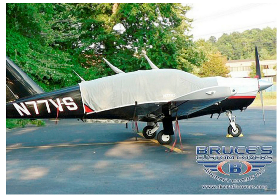
Socata TB20 Canopy Cover