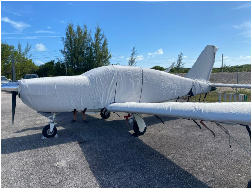
Socata TB-20 Trinidad Complete Cover Set

WINTER USE MATERIAL - Made with Solution-Dyed Polyester fabric, this option is intended for seasonal use to aid in deicing, rain mitigation, or for occasional travel. The material is lighter and more compact, but more susceptible to UV damage and may have a shorter useful life if used continuously outside than the all-year use material.