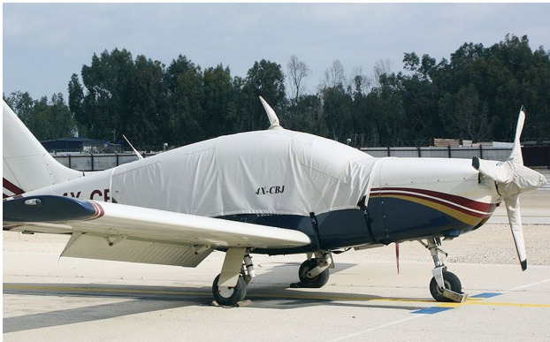
SOCATA TB-20 Canopy & Prop Covers

This cover type is made from Silver Acrylic Sunbrella canvas and is 100% lined with a soft and smooth microfiber. Bruce's Custom Covers developed this material combination especially for aircraft protection. The outer material is medium weight and treated for water resistance, UV resistance and anti-static buildup. The inner lining is a very soft and smooth microfiber to prevent scratching. The material is very reflective, and tests show that the cabin interior temperature can be reduced to near-ambient temperature on the hottest of days. It is water, ice and snow repellent, yet breathable to allow moisture to escape from between the cover and the aircraft surface.