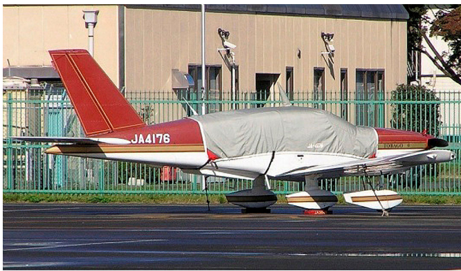
Socata TB-10 Tampico Canopy Cover