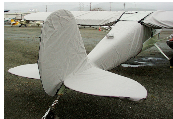
Cessna 120 Empennage Cover

WINTER USE MATERIAL - Made with Solution-Dyed Polyester fabric, this option is intended for seasonal use to aid in deicing, rain mitigation, or for occasional travel. The material is lighter and more compact, but more susceptible to UV damage and may have a shorter useful life if used continuously outside than the all-year use material.