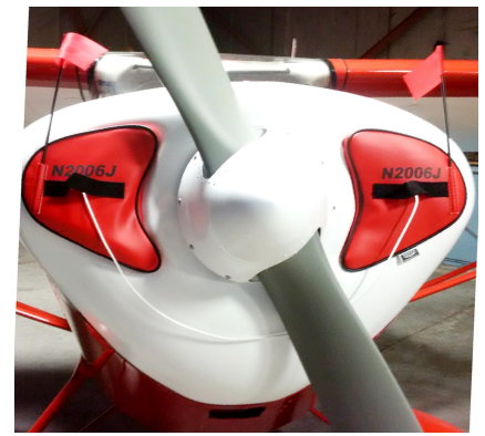
Taylorcraft Engine Inlet Plugs