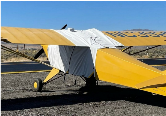
Taylorcraft BC-12D Extended Canopy Cover

This cover type is made from Silver Acrylic Sunbrella canvas and is 100% lined with a soft and smooth microfiber. Bruce's Custom Covers developed this material combination especially for aircraft protection. The outer material is medium weight and treated for water resistance, UV resistance and anti-static buildup. The inner lining is a very soft and smooth microfiber to prevent scratching. The material is very reflective, and tests show that the cabin interior temperature can be reduced to near-ambient temperature on the hottest of days. It is water, ice and snow repellent, yet breathable to allow moisture to escape from between the cover and the aircraft surface.