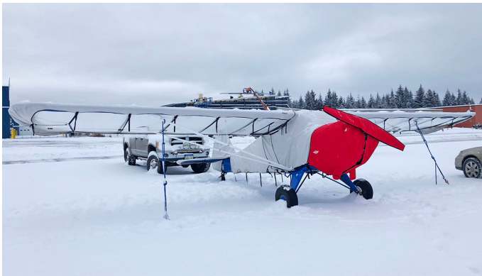
Taylorcraft Aviation Corp F19 Insulated Engine Cover