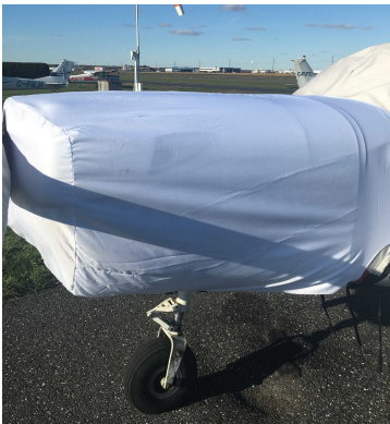
Slingsby T-67C Firefly Engine Cover, test fit cover