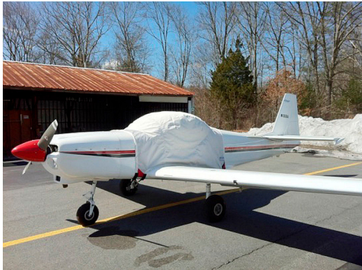
Slingsby T-67 Firefly Extended Canopy Cover

This cover type is made from Silver Acrylic Sunbrella canvas and is 100% lined with a soft and smooth microfiber. Bruce's Custom Covers developed this material combination especially for aircraft protection. The outer material is medium weight and treated for water resistance, UV resistance and anti-static buildup. The inner lining is a very soft and smooth microfiber to prevent scratching. The material is very reflective, and tests show that the cabin interior temperature can be reduced to near-ambient temperature on the hottest of days. It is water, ice and snow repellent, yet breathable to allow moisture to escape from between the cover and the aircraft surface.