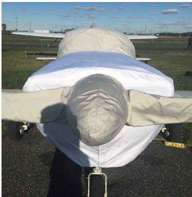
Slingsby T-67C Firefly Engine Cover, test fit cover

This cover type is made from Silver Acrylic Sunbrella canvas and is 100% lined with a soft and smooth microfiber. Bruce's Custom Covers developed this material combination especially for aircraft protection. The outer material is medium weight and treated for water resistance, UV resistance and anti-static buildup. The inner lining is a very soft and smooth microfiber to prevent scratching. The material is very reflective, and tests show that the cabin interior temperature can be reduced to near-ambient temperature on the hottest of days. It is water, ice and snow repellent, yet breathable to allow moisture to escape from between the cover and the aircraft surface.