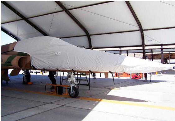
Northup F-5 Talon Canopy/Nose Cover