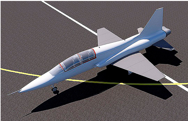
T-38 Talon Wing and Horizontal Stabilizer Covers (3D Rendering)

WINTER USE MATERIAL - Made with Solution-Dyed Polyester fabric, this option is intended for seasonal use to aid in deicing, rain mitigation, or for occasional travel. The material is lighter and more compact, but more susceptible to UV damage and may have a shorter useful life if used continuously outside than the all-year use material.