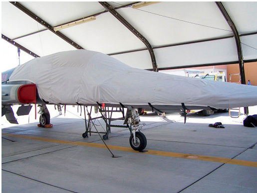
Northup F5 Talon Canopy Cover

This cover type is made from Silver Acrylic Sunbrella canvas and is 100% lined with a soft and smooth microfiber. Bruce's Custom Covers developed this material combination especially for aircraft protection. The outer material is medium weight and treated for water resistance, UV resistance and anti-static buildup. The inner lining is a very soft and smooth microfiber to prevent scratching. The material is very reflective, and tests show that the cabin interior temperature can be reduced to near-ambient temperature on the hottest of days. It is water, ice and snow repellent, yet breathable to allow moisture to escape from between the cover and the aircraft surface.