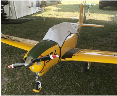
Beechcraft T-34B Mentor Canopy Cover, for 36% Scale Model

Travel Covers are made with Silver Solution-Dyed Polyester fabric and only lined over the windshield to save weight. The material is lightweight and more compact for easy stowage in the aircraft. The polyester material is water resistant, but only intended for occasional use outside. We also have an ultra lightweight material available for fitted hangar dust covers. For daily outdoor use, the non-travel Sunbrella Cover is the best choice.