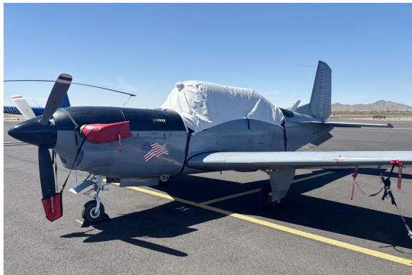
Beech T34 Mentor Prop Tie-Down/Exhaust Covers, Turboprop Model (T34c)

This cover type is made from Silver Acrylic Sunbrella canvas and is 100% lined with a soft and smooth microfiber. Bruce's Custom Covers developed this material combination especially for aircraft protection. The outer material is medium weight and treated for water resistance, UV resistance and anti-static buildup. The inner lining is a very soft and smooth microfiber to prevent scratching. The material is very reflective, and tests show that the cabin interior temperature can be reduced to near-ambient temperature on the hottest of days. It is water, ice and snow repellent, yet breathable to allow moisture to escape from between the cover and the aircraft surface.