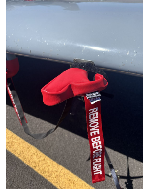
Beech T34 Mentor Pitot Cover and AOA Cover