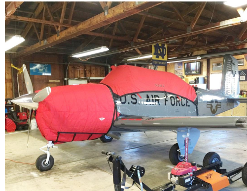
Beech T34 Mentor Canopy Cover, Insulated Engine Cover