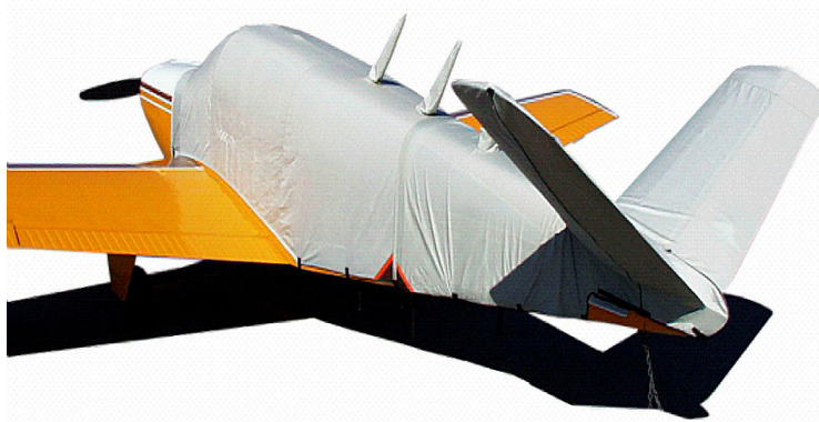
Extended Canopy Cover & Empennage Cover

WINTER USE MATERIAL - Made with Solution-Dyed Polyester fabric, this option is intended for seasonal use to aid in deicing, rain mitigation, or for occasional travel. The material is lighter and more compact, but more susceptible to UV damage and may have a shorter useful life if used continuously outside than the all-year use material.