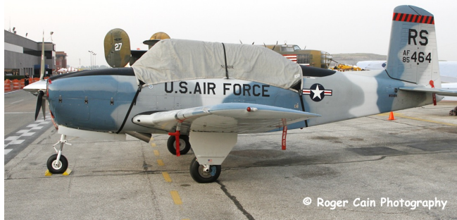
Beech T34 Canopy Cover

This cover type is made from Silver Acrylic Sunbrella canvas and is 100% lined with a soft and smooth microfiber. Bruce's Custom Covers developed this material combination especially for aircraft protection. The outer material is medium weight and treated for water resistance, UV resistance and anti-static buildup. The inner lining is a very soft and smooth microfiber to prevent scratching. The material is very reflective, and tests show that the cabin interior temperature can be reduced to near-ambient temperature on the hottest of days. It is water, ice and snow repellent, yet breathable to allow moisture to escape from between the cover and the aircraft surface.