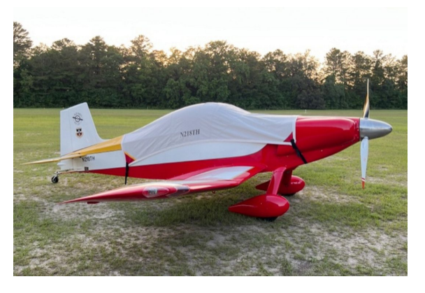
Thorp T-18 & Bushby Mustang Complete Cover, test fit cover