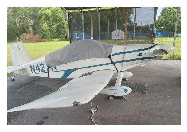
Thorp T-18 Travel Cover

Travel Covers are made with Silver Solution-Dyed Polyester fabric and only lined over the windshield to save weight. The material is lightweight and more compact for easy stowage in the aircraft. The polyester material is water resistant, but only intended for occasional use outside. We also have an ultra lightweight material available for fitted hangar dust covers. For daily outdoor use, the non-travel Sunbrella Cover is the best choice.