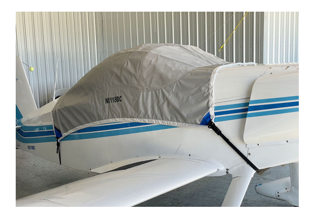
T-18 Travel Cover, Light Weight Canopy Cover (Bubble Canopy)