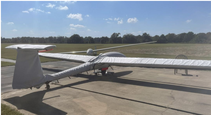
Pdps Pzl-Bielsko SZD-48-3

WINTER USE MATERIAL - Made with Solution-Dyed Polyester fabric, this option is intended for seasonal use to aid in deicing, rain mitigation, or for occasional travel. The material is lighter and more compact, but more susceptible to UV damage and may have a shorter useful life if used continuously outside than the all-year use material.