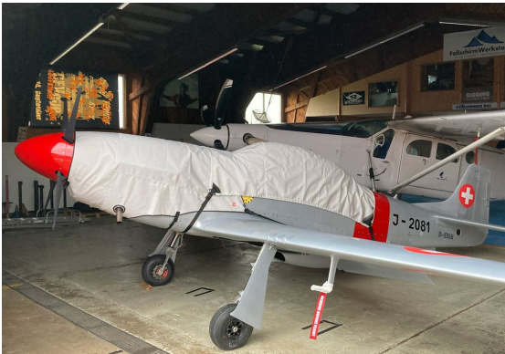
SW-51 Mustang Canopy & Engine Covers