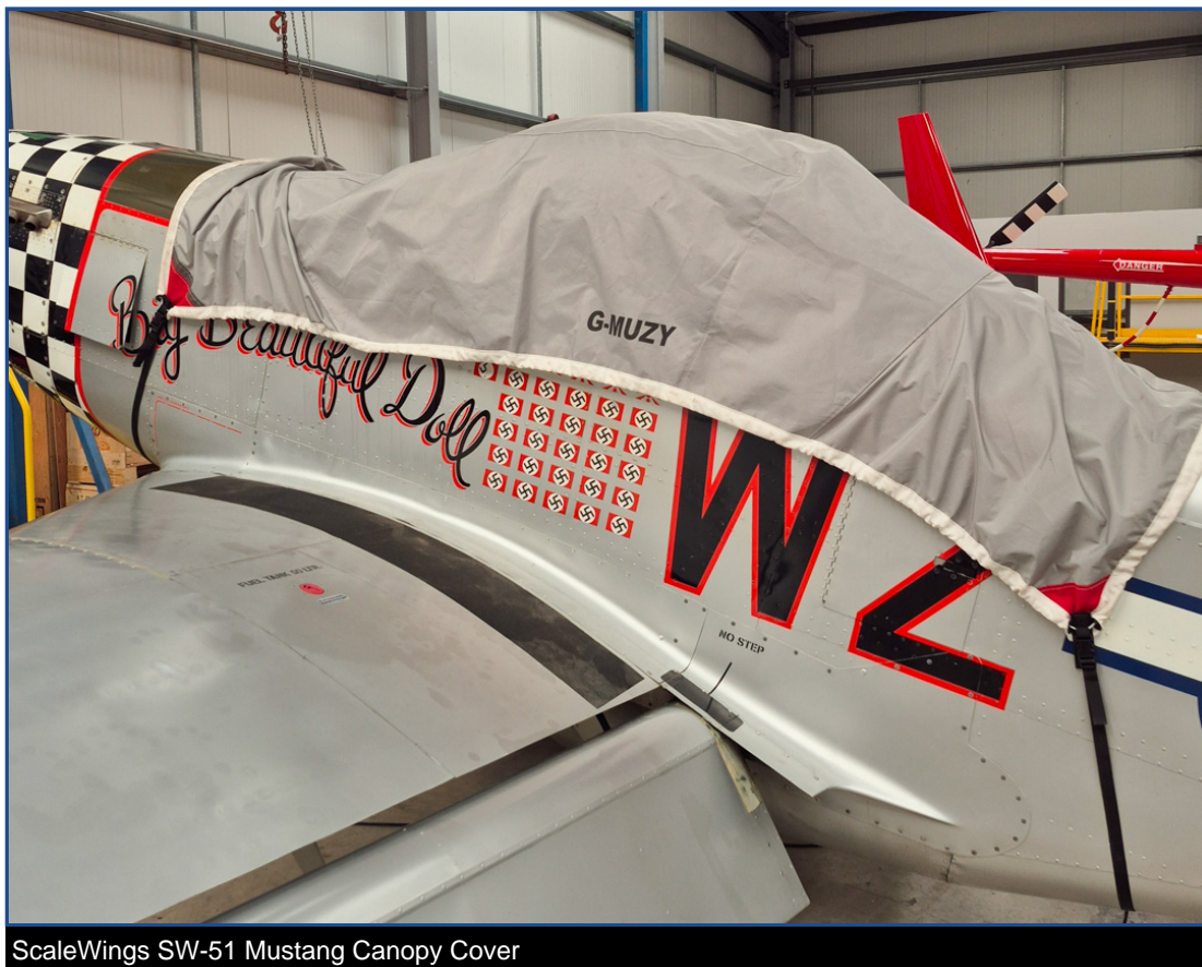
ScaleWings SW-51 Mustang Canopy Cover