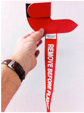
Standard Pitot Cover