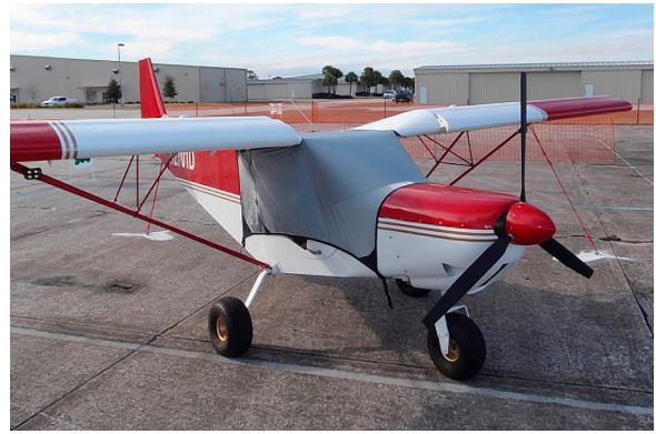
Zenith 701 Spandex FlyAway Travel Canopy Cover