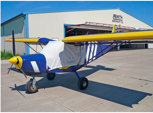
Zenith 701 Standard Canopy Cover