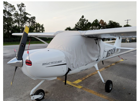
Cessna Skycatcher 162 Canopy Cover and Engine Inlet Plugs