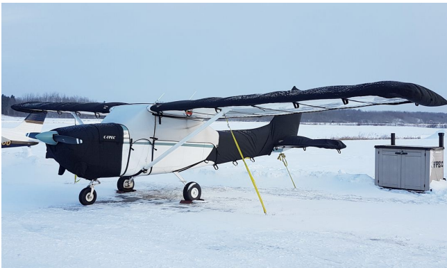
Cessna 172 Engine Plugs and Canopy, Wing, Horizontal Stabilizer Covers Cessna 172 Engine, Wings and Empennage Covers