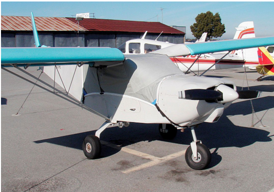
Zenith 801 Standard Canopy Cover

This cover type is made from Silver Acrylic Sunbrella canvas and is 100% lined with a soft and smooth microfiber. Bruce's Custom Covers developed this material combination especially for aircraft protection. The outer material is medium weight and treated for water resistance, UV resistance and anti-static buildup. The inner lining is a very soft and smooth microfiber to prevent scratching. The material is very reflective, and tests show that the cabin interior temperature can be reduced to near-ambient temperature on the hottest of days. It is water, ice and snow repellent, yet breathable to allow moisture to escape from between the cover and the aircraft surface.