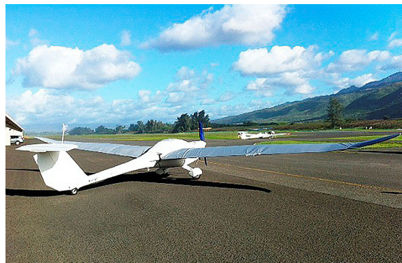
Lambada Canopy/Engine Cover and Wing Covers