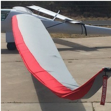
Stemme S-12 Wing Covers, Spandex Type

WINTER USE MATERIAL - Made with Solution-Dyed Polyester fabric, this option is intended for seasonal use to aid in deicing, rain mitigation, or for occasional travel. The material is lighter and more compact, but more susceptible to UV damage and may have a shorter useful life if used continuously outside than the all-year use material.