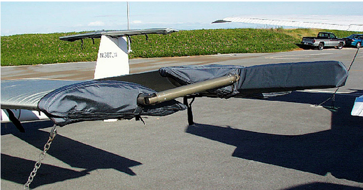
End Cap Covers are used when wing are in folded position.