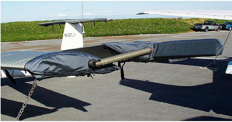
End Cap Covers are used when wing are in folded position.