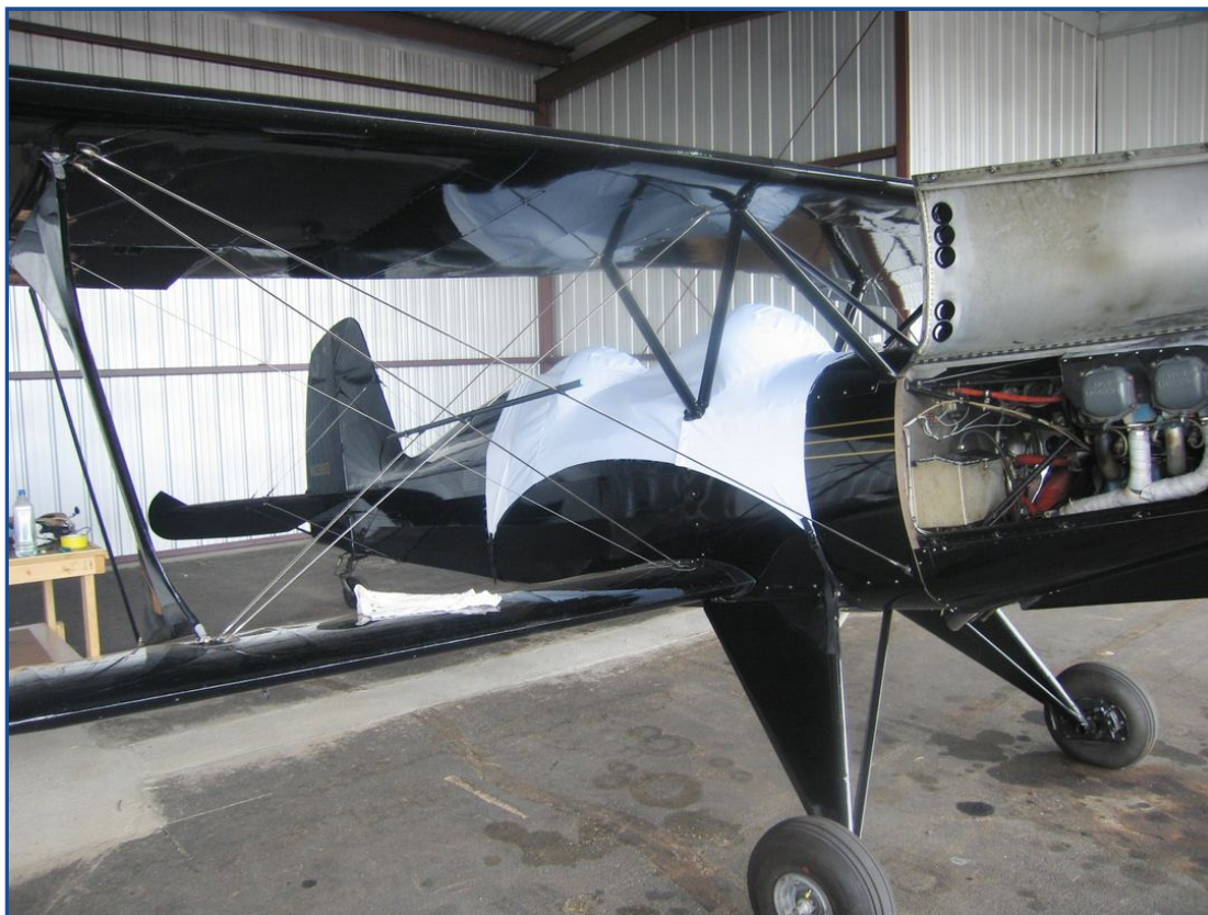
Starduster Too Canopy Cover, test fit cover