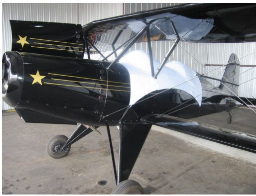
Starduster Too Canopy Cover, test fit cover