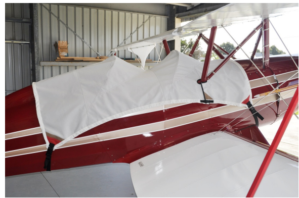
Starduster Too Canopy Cover