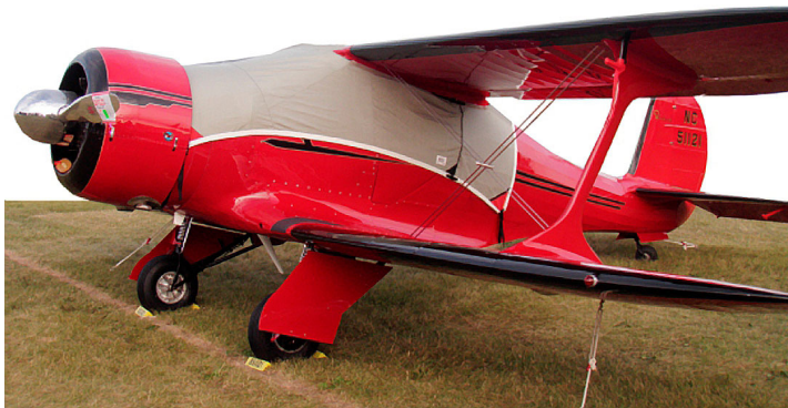
Beech Staggerwing Canopy Cover

This cover type is made from Silver Acrylic Sunbrella canvas and is 100% lined with a soft and smooth microfiber. Bruce's Custom Covers developed this material combination especially for aircraft protection. The outer material is medium weight and treated for water resistance, UV resistance and anti-static buildup. The inner lining is a very soft and smooth microfiber to prevent scratching. The material is very reflective, and tests show that the cabin interior temperature can be reduced to near-ambient temperature on the hottest of days. It is water, ice and snow repellent, yet breathable to allow moisture to escape from between the cover and the aircraft surface.