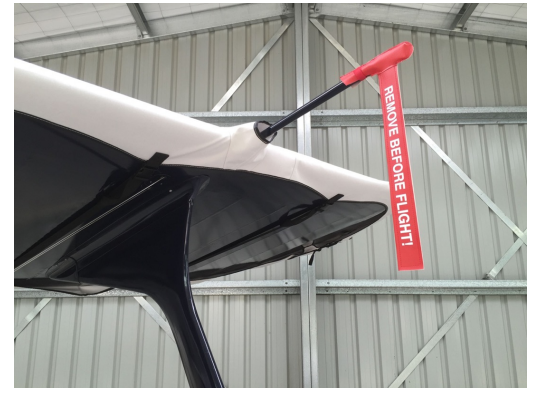
Beech Staggerwing Complete Cover Set, Upper Wing Detail