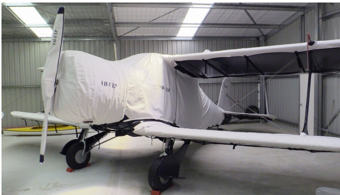
Beech Staggerwing Complete Cover Set

This cover type is made from Silver Acrylic Sunbrella canvas and is 100% lined with a soft and smooth microfiber. Bruce's Custom Covers developed this material combination especially for aircraft protection. The outer material is medium weight and treated for water resistance, UV resistance and anti-static buildup. The inner lining is a very soft and smooth microfiber to prevent scratching. The material is very reflective, and tests show that the cabin interior temperature can be reduced to near-ambient temperature on the hottest of days. It is water, ice and snow repellent, yet breathable to allow moisture to escape from between the cover and the aircraft surface.