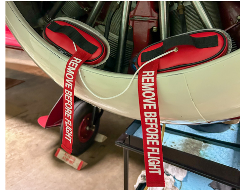
Beech Staggerwing Carb Inlet Plugs, Located Inside Engine