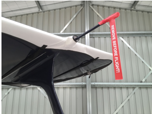
Beech Staggerwing Complete Cover Set, Upper Wing Detail

Engine Inlet Plugs are custom fit for your Beech Staggerwing intakes, made with heavy-duty vinyl material, and stuffed with a single block of sculpted urethane foam. Each plug has a zipper that allows the foam to be removed and dried if necessary. Engine plugs have warning flags that are visible from the cockpit or 'remove before flight' streamers sewn onto the face of the plugs. Most plugs are imprinted with the aircraft registration number in black for an extra charge. Storage bag NOT included. Engine plugs may be inserted after flight when the engine is still warm. Engine Inlet Plugs are commonly referred to as Cowl Plugs, Intake Plugs, Cowl Blocks, Engine Blocks, and Engine Bungs.