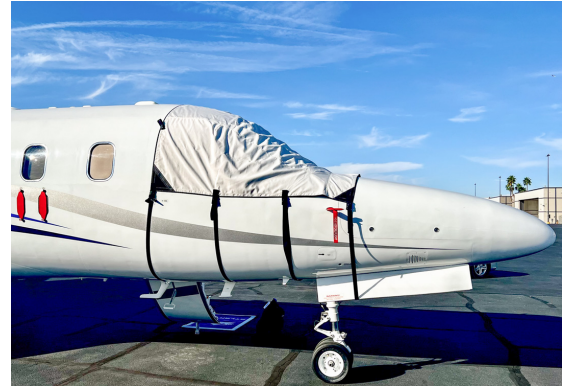
IAI Astra SPX Cockpit Cover