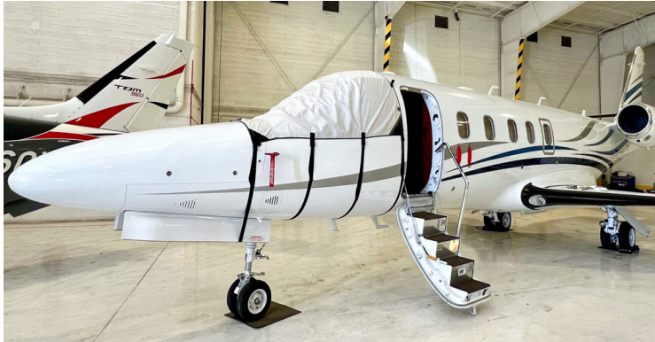
Astra SPX Cockpit Cover

This cover type is made from Silver Acrylic Sunbrella canvas and is 100% lined with a soft and smooth microfiber. Bruce's Custom Covers developed this material combination especially for aircraft protection. The outer material is medium weight and treated for water resistance, UV resistance and anti-static buildup. The inner lining is a very soft and smooth microfiber to prevent scratching. The material is very reflective, and tests show that the cabin interior temperature can be reduced to near-ambient temperature on the hottest of days. It is water, ice and snow repellent, yet breathable to allow moisture to escape from between the cover and the aircraft surface.