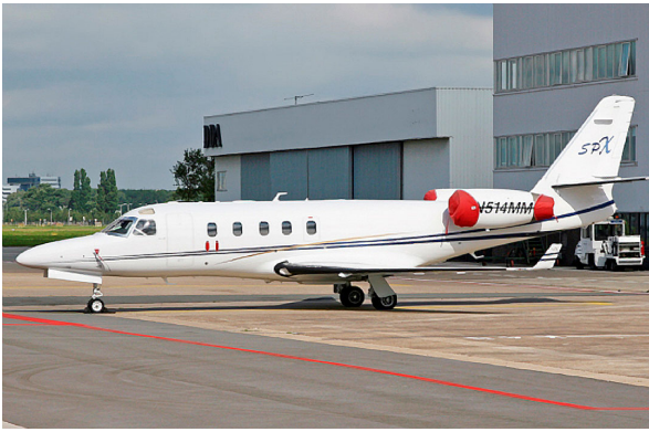
IAI-1125A Astra SPX Engine Cover set