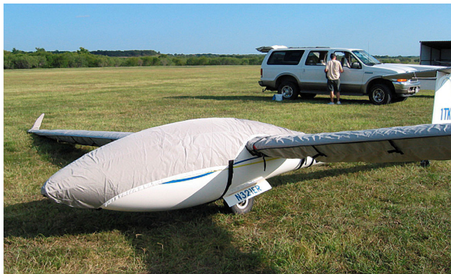
Canopy/Nose Cover, Wings and Horizontal Stab Covers

This cover type is made from Silver Acrylic Sunbrella canvas and is 100% lined with a soft and smooth microfiber. Bruce's Custom Covers developed this material combination especially for aircraft protection. The outer material is medium weight and treated for water resistance, UV resistance and anti-static buildup. The inner lining is a very soft and smooth microfiber to prevent scratching. The material is very reflective, and tests show that the cabin interior temperature can be reduced to near-ambient temperature on the hottest of days. It is water, ice and snow repellent, yet breathable to allow moisture to escape from between the cover and the aircraft surface.