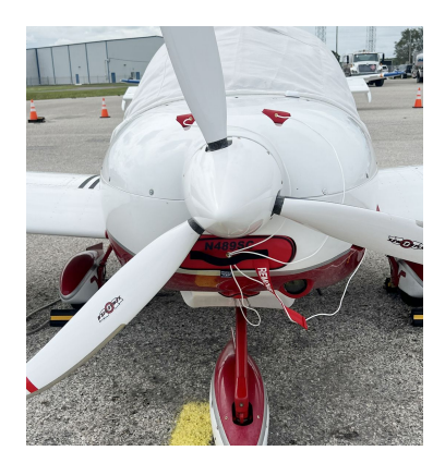
SportCruiser Engine Inlet Plugs

Engine Inlet Plugs are custom fit for your Czech Aircraft Works SportCruiser intakes, made with heavy-duty vinyl material, and stuffed with a single block of sculpted urethane foam. Each plug has a zipper that allows the foam to be removed and dried if necessary. Engine plugs have warning flags that are visible from the cockpit or 'remove before flight' streamers sewn onto the face of the plugs. Most plugs are imprinted with the aircraft registration number in black for an extra charge. Storage bag NOT included. Engine plugs may be inserted after flight when the engine is still warm. Engine Inlet Plugs are commonly referred to as Cowl Plugs, Intake Plugs, Cowl Blocks, Engine Blocks, and Engine Bungs.