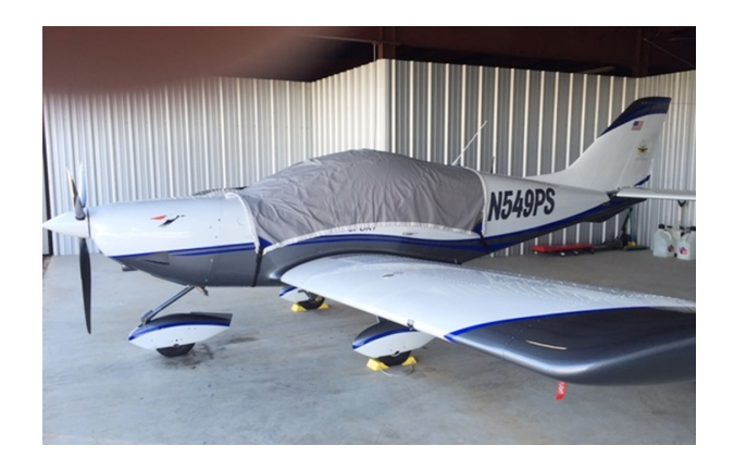
PiperSport Light Weight Travel Cover

This cover type is made from Silver Acrylic Sunbrella canvas and is 100% lined with a soft and smooth microfiber. Bruce's Custom Covers developed this material combination especially for aircraft protection. The outer material is medium weight and treated for water resistance, UV resistance and anti-static buildup. The inner lining is a very soft and smooth microfiber to prevent scratching. The material is very reflective, and tests show that the cabin interior temperature can be reduced to near-ambient temperature on the hottest of days. It is water, ice and snow repellent, yet breathable to allow moisture to escape from between the cover and the aircraft surface.