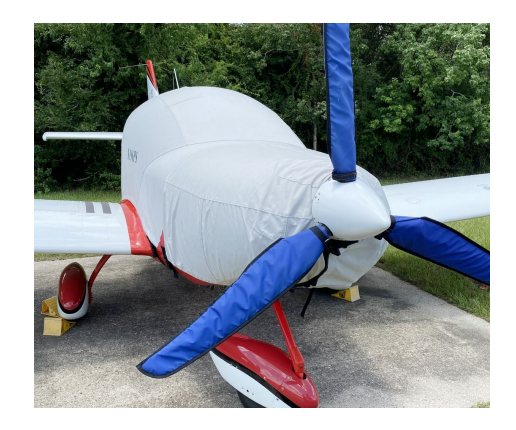
PiperSport Extended Canopy/Engine Cover