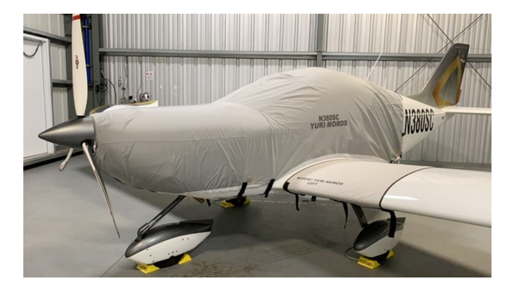
Sportcruiser Wing Covers