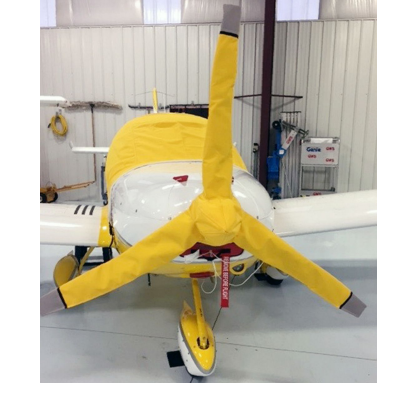
Custom Yellow Canopy Cover, Prop/Spinner, and Inlet Plugs