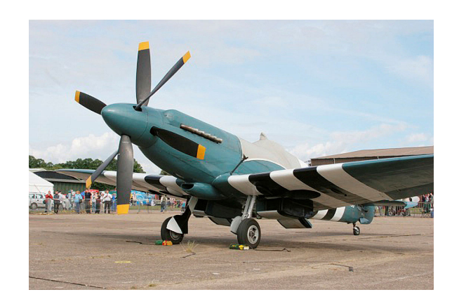
Supermarine Spitfire XIX Canopy Cover

Travel Covers are made with Silver Solution-Dyed Polyester fabric and only lined over the windshield to save weight. The material is lightweight and more compact for easy stowage in the aircraft. The polyester material is water resistant, but only intended for occasional use outside. We also have an ultra lightweight material available for fitted hangar dust covers. For daily outdoor use, the non-travel Sunbrella Cover is the best choice.