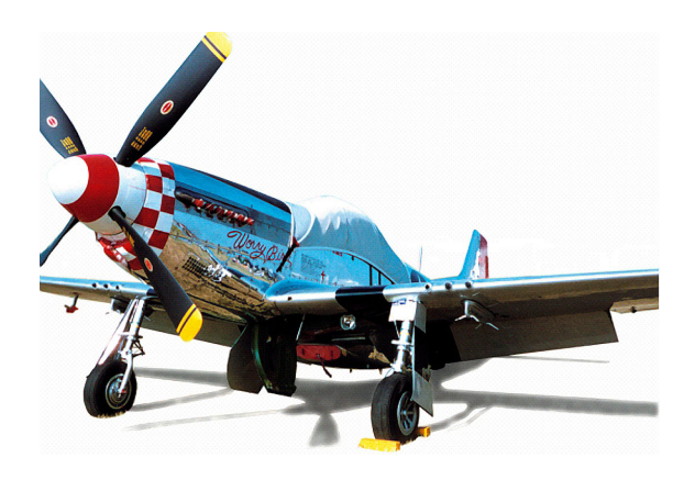
Canopy Cover, Belly & Chin Scoop Plugs